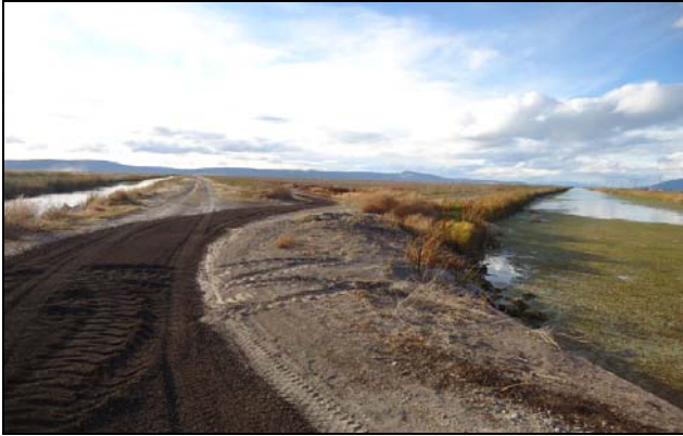
Irrigation drains and access roads in Tule Lake Watershed.

Highlights included the Lost River, the Tule Lake sumps, wildlife refuges, irrigation water supply canals, irrigation drains, water movement practices, farming practices, and the wetland restoration program known as walking wetlands.