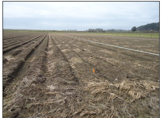
Lily bulb fields with straw residue check dams in the furrows, irrigation pipe, and rotational grazing field (on the far side of the fence).