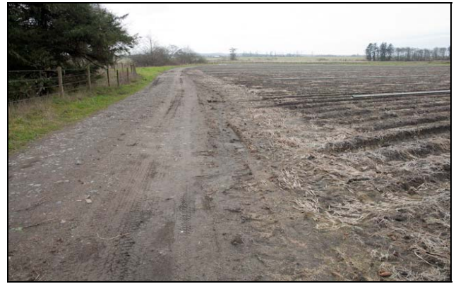
Lily bulb fields and tractor turn around area.

Members of the Easter lily bulb agricultural community also generously hosted a tour for Regional Water Board staff. Easter lily bulbs are grown in a small area of Del Norte County on the plain bordering the Smith River estuary. Highlights included a presentation on growing practices and timing, pesticide use, and monitoring history followed by a field visit of planted fields, rotational grazing fields, best management practices, and receiving water bodies.