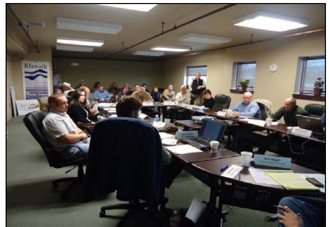
Tulelake/Butte Valley Advisory Group Meeting.