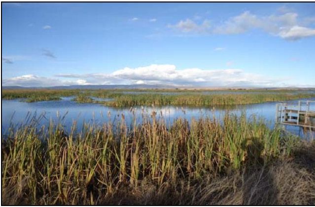
Walking wetland in Tule Lake Watershed.