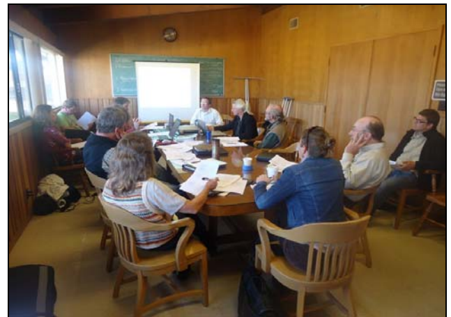
Humboldt/Trinity/Del Norte Advisory Group Meeting.

http://www.waterboards.ca.gov/northcoast/water_issues/programs/agricultural_lands/ .