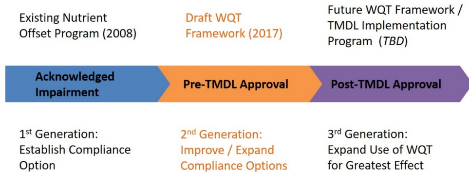
Figure 2. Evolution of Water Quality Trading Program Development in the Laguna de Santa Rosa Watershed

Figure 2 illustrates the evolution of WQT program development in the Laguna de Santa Rosa watershed as understood and anticipated by staff, beginning with the existing Santa Rosa Nutrient Offset Program in 2008, continuing with the Draft Framework in 2017, and ending with a future version of a WQT framework specifically designed to be consistent with the Laguna TMDLs once they are adopted.