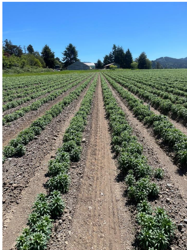
Photo Caption: Lily bulb field midway through the cultivation season in the Smith River Plain.

SWAMP monitoring supporting the development of site-specific water quality thresholds for copper in the Smith River Plain is expected to conclude in November 2024. The thresholds will be developed by Regional Water Board staff using collected data and the USEPA endorsed Biotic Ligand Model to assess the risk of toxicity from copper concentrations in surface water.