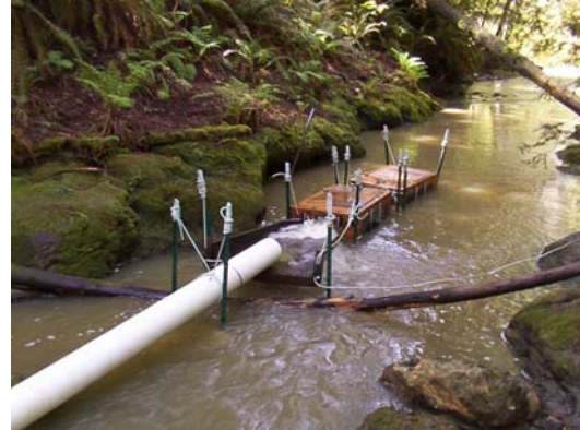
This is a smolt trap. On the South Fork of Freshwater Creek, Fish and Game maintains this trap.

Logging activities increased in the late 1980s and early 1990s. These activities had numerous environmental impacts which lead to increased scrutiny by Federal and State agencies. Eventually, Pacific Lumber Company, at the time the owner of the majority of timberlands in Freshwater Creek, agreed to conduct timber operations under a Habitat Conservation Plan to protect endangered species as part of the Headwaters Agreement.