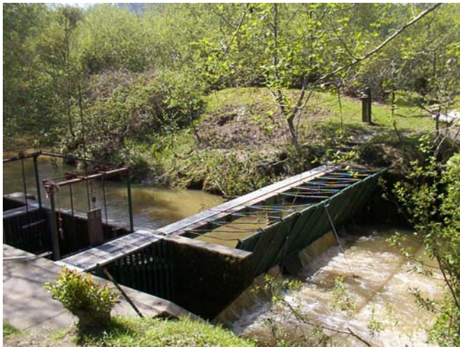
Fish weir on Freshwater Creek, Fish and Game maintains this trap.

The TMDL for this watershed was reprioritized by the Regional Water Board and scheduled for development by 2003. However, implementations of a permitting program, petitions, litigation, enforcement matters and contracting difficulties have all contributed to delays in developing the TMDL. Currently, staff is again actively working on the TMDL and nearing completion on drafts of the first two chapters, the introduction and problem statement. Staff is continuing to work on a significant portion of the TMDL, which is the development of the source analysis. We anticipate a public review draft of this section and other components of the TMDL by March 2010. We anticipate this review will include CEQA scoping, a Regional