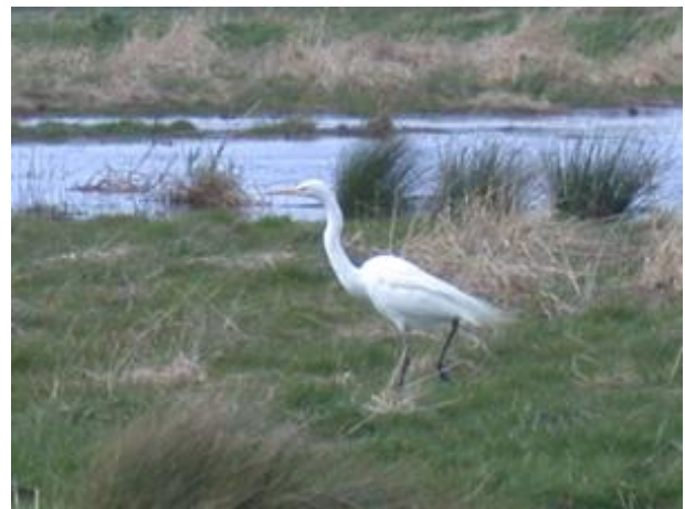
Great Egret at Fay Slough Wildlife Area

Region 1 staff presented an information item on the wetland definition developed by the Wetland Policy Development Team's Technical Advisory Team (TAT). The Board gave the Wetland Policy Development Team two directives: 1) to inform the Board of any variance between the U.S. Army Corps of Engineers' wetland definition and delineation methods and the TAT's definition and delineation methods, and 2) solicit stakeholder input prior to the 60-day public comment period on Phase 1 of the Policy.