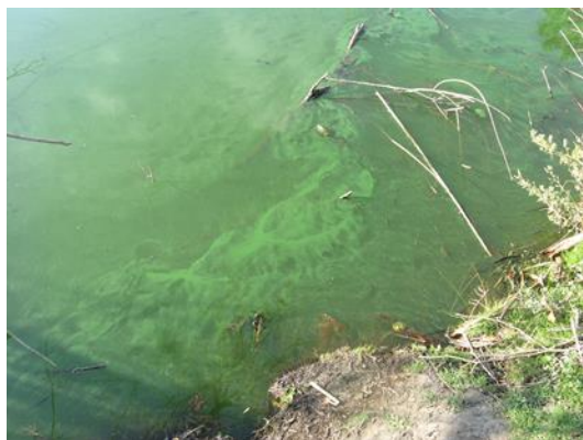
This photo taken at South Pond in Area III shows algal bloom, bright green in color.

Earlier this month, scientists working with the Los Angeles Regional Water Quality Control Board sampled surface water along the shoreline near recreation areas and discovered a cyanoHAB. Local environmental and public health agencies have begun the recommended postings at the locations.