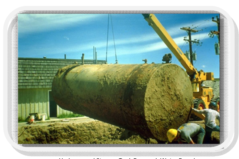
Underground Storage Tank Removal, Water Boards

In 2015, as part of a settlement agreement, the State Water Board permanently disqualified 90 of British Petroleum North America's (BPNA) UST cleanup sites from the UST Cleanup Fund (Cleanup Fund) for claiming reimbursement through false or misleading statements. The agreement significantly reduced BPNA's future claims against the Cleanup Fund, which is administered by the State Water Board. The Cleanup Fund assists small businesses and individuals by providing reimbursement for expenses associated with the cleanup of leaking USTs. The Cleanup Fund also provides money to the Regional Water Boards and local regulatory agencies to abate emergency situations, or to clean up abandoned sites that pose a threat to human health, safety, and the environment, as a result of a UST petroleum release. Disqualifying those 90 sites could save up to $135 million that could be used for other contaminated sites. In addition, BPNA's 153 other