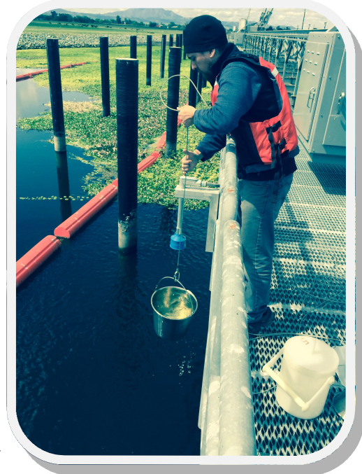
Pathogen Sample Collecting in Rock Slough, CA Dept. of Water Resources

http://www.waterboards.ca.gov/centralvalley/water_issues/delta_water_quality/comprehensive_monitoring_program/index.shtml