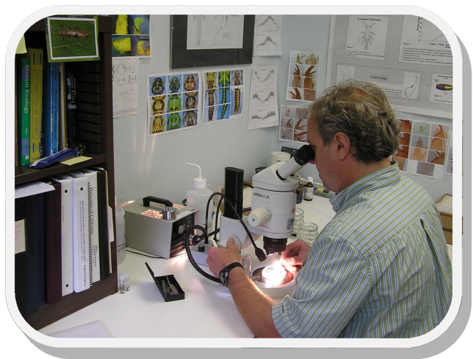
Bioassessment Monitoring, State Water Board

For more information: http://www.waterboards.ca.gov/sanfranciscobay/board_decisions/adopted_orders/2015/R2-2015-0020.pdf