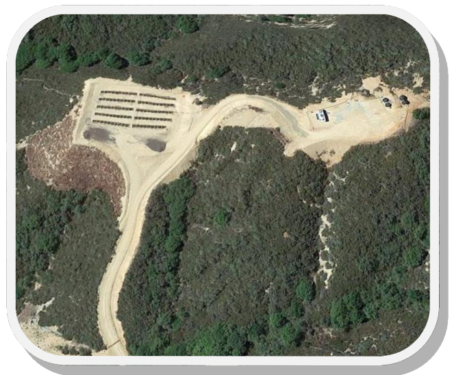
Marijuana Cultivation Site, State Water Board

In June 2014, the State Legislature approved funding for the Water Boards and the CA Department of Fish and Wildlife (CDFW) to work collaboratively to reduce environmental damage caused by the cultivation of marijuana (cannabis) through the initiation of the Marijuana Pilot Project. During 2015, the State Water Board, the North Coast Regional Water Board, the Central Valley Regional Water Board, and CDFW worked diligently to implement the primary goals of the pilot project: development of a regulatory permitting strategy; enforcement, education, and outreach; and agency and stakeholder coordination. During the year, the North Coast Regional Water Board and the Central Valley Regional Water Board adopted permitting programs to regulate discharges of waste resulting from cannabis cultivation sites. In addition, the State and Regional Water Boards, along with CDFW, conducted nearly 200 inspections of cannabis cultivation sites, pursued numerous enforcement actions, and worked with contractors to continue the development of the Cannabis Identification and