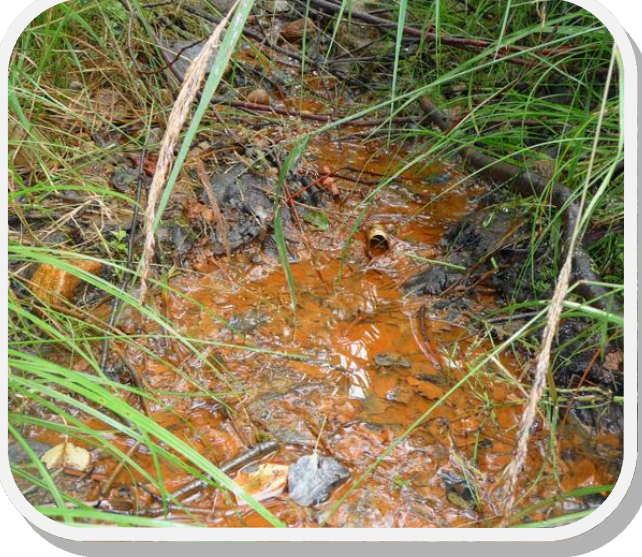
Act (CERCLA) process, with ARCO conducting remedial investigation activities and developing a feasibility study. Ultimately, a final cleanup project addressing acid mine drainage discharges and their impacts will be selected and implemented for many decades, possibly centuries. The Regional Water Board will be responsible for designing, constructing, operating, and maintaining the final selected project, with ARCO paying the majority of construction and operations/ maintenance costs. To date, the Regional Water Board and ARCO have collectively spent approximately $100 million on cleanup activities at the mine. Signing the Settlement Agreement also avoids additional litigation costs and sets up a cost-sharing system between the State of

California and ARCO moving into the future.