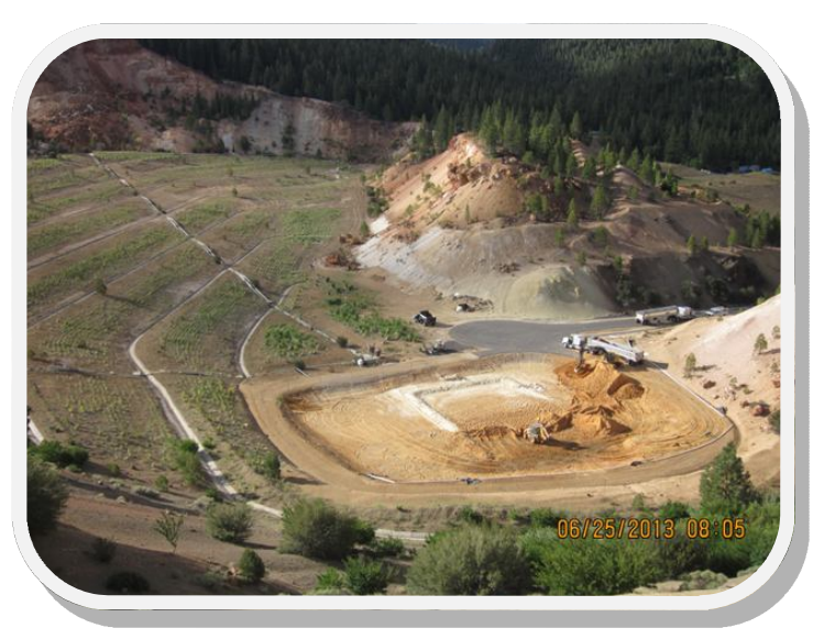
Leviathan Mine Sludge Clean Out, Lahontan Regional Water Board

In March 2015, the Lahontan Regional Water Board, other State agencies, and the Atlantic Richfield Company (ARCO) signed a Settlement Agreement to clean up pollutant discharges from the Leviathan Mine Superfund Site, an inactive open-pit sulfur mine in Alpine County. Major environmental problems arose during sulfur mining operations at the site during the 1950s and 1960s. ARCO was identified as a potentially responsible party, and in November 2000 was put under orders from USEPA to conduct certain cleanup activities to address acidic mine drainage at the site. The Regional Water Board has been working at the site since the State acquired it in 1984, and has overseen multiple projects intended to reduce acid mine drainage discharges and their impacts on local area surface waters. In 2015, the Regional Water Board's onsite treatment system neutralized and removed metals from approximately 2.5 million gallons of acid mine drainage. Due to drought conditions resulting in a low amount of acidic mine drainage from the site, 2015 was a light treatment year compared to the more than 20 million gallons treated in 2011, which was a significant wet year.