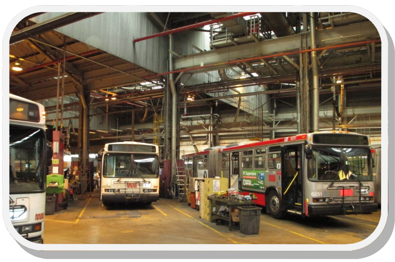
SFMTA Transit Garage, State Water Board

In July 2015, the State Water Board reached a $1.35 million settlement with the San Francisco Municipal Transportation Agency (SFMTA) for violating leak prevention requirements for hazardous substances at four underground storage tank (UST) facilities in San Francisco. SFMTA's history of noncompliance resulted in two enforcement actions in the last decade. In 2005, a 39,000-gallon diesel fuel spill into San Francisco Bay at one of SFMTA's facilities resulted in a $250,000 civil penalty imposed by USEPA. SFMTA's recent failure to comply with leak prevention requirements necessitated a more significant penalty. Under the terms of the settlement, SFMTA paid to the State Water Board $425,000 in civil penalties and $100,000 for the reimbursement of enforcement costs. The settlement suspended $375,000 conditioned on SFMTA completing several actions that will enhance compliance at their UST facilities. The remaining $450,000 was suspended conditioned on SFMTA maintaining compliance with the UST leak prevention requirements specified in the judgment, which go above and beyond the regulatory requirements, for a period of five years.