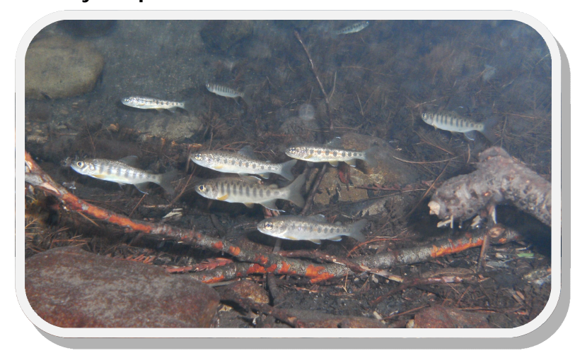
Coho Salmon, North Coast Regional Water Board

In January 2015, the North Coast Regional Water Board adopted the Policy in Support of Restoration in the North Coast Region (Policy) and the associated Water Quality Control Plan (Basin Plan) amendment. The Policy is primarily a narrative expressing support for restoration and similar type projects in the North Coast Region, recognizing that pollutant controls alone are not always sufficient to attain water quality standards. The Policy describes: the importance of restoration projects for the protection, enhancement, and recovery of beneficial uses; the obstacles that slow or preclude restoration actions; the legal and procedural requirements for permitting restoration projects; the ongoing Regional Water Board effort to provide support toward the implementation of restoration projects; and direction to staff to continue to support restoration in the future. The Regional