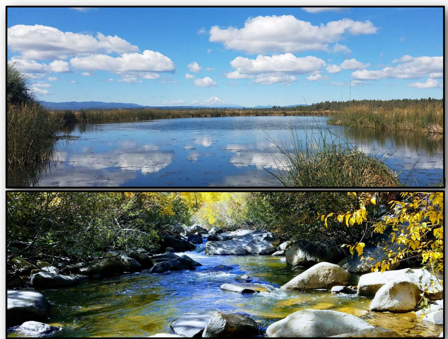
July 1-2, 2019

Open Water California: Innovating Through Integrating and Expanding the Water Data Community