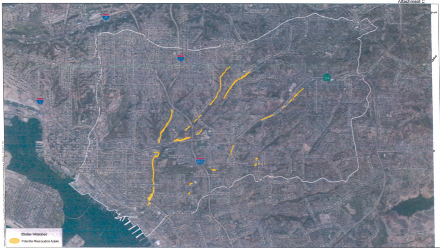
Potential Creek Restoration Areas - Chollas Watershed CHOLLAS WATERSHED MASTER PLAN