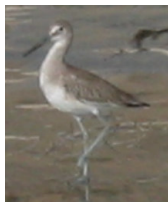
Willet at Tijuana Estuary shoreline

The unit's only coastal lagoon is the Tijuana Estuary which occupies approximately 2,000 acres and is generally open to the ocean. Most of the area can be classified as a salt water marsh with a number of arms of open water. Water quality is generally the same as that of the sea water except during periods of runoff when a variety of wastes, which originate in Mexico, are carried into the lagoon from the surface flow in the Tijuana River.