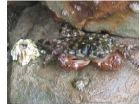
Shore crab at Scripps Coastal Reserve

Carlsbad HU is a roughly triangular-shaped area of about 210 square miles, extending from Lake Wohlford on the east to