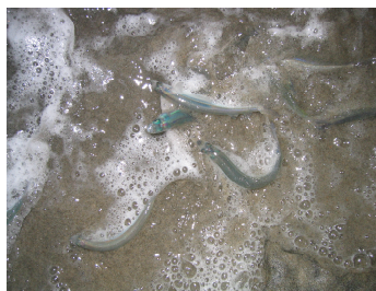
Grunion spawning at Ocean Beach

The Penasquitos HU is comprised of the following five HAs; the Miramar Reservoir, Poway, Scripps, Miramar, and Tecolote HAs.