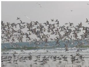
Shorebirds at Tijuana Estuary shoreline

The San Diego Region forms the southwest corner of California and occupies