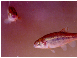
Arroyo chub at Rainbow Creek

The San Luis Rey Unit contains two coastal lagoon areas, the mouth of the San Luis Rey River and Loma Alta Slough. The mouth of the San Luis Rey River is entirely within the city of Oceanside and is adjacent to the city's northern boundary. The slough area at the mouth of the river is contiguous with Oceanside Harbor. Loma Alta Slough is entirely within the city of Oceanside and is the mouth of Loma Alta Creek.