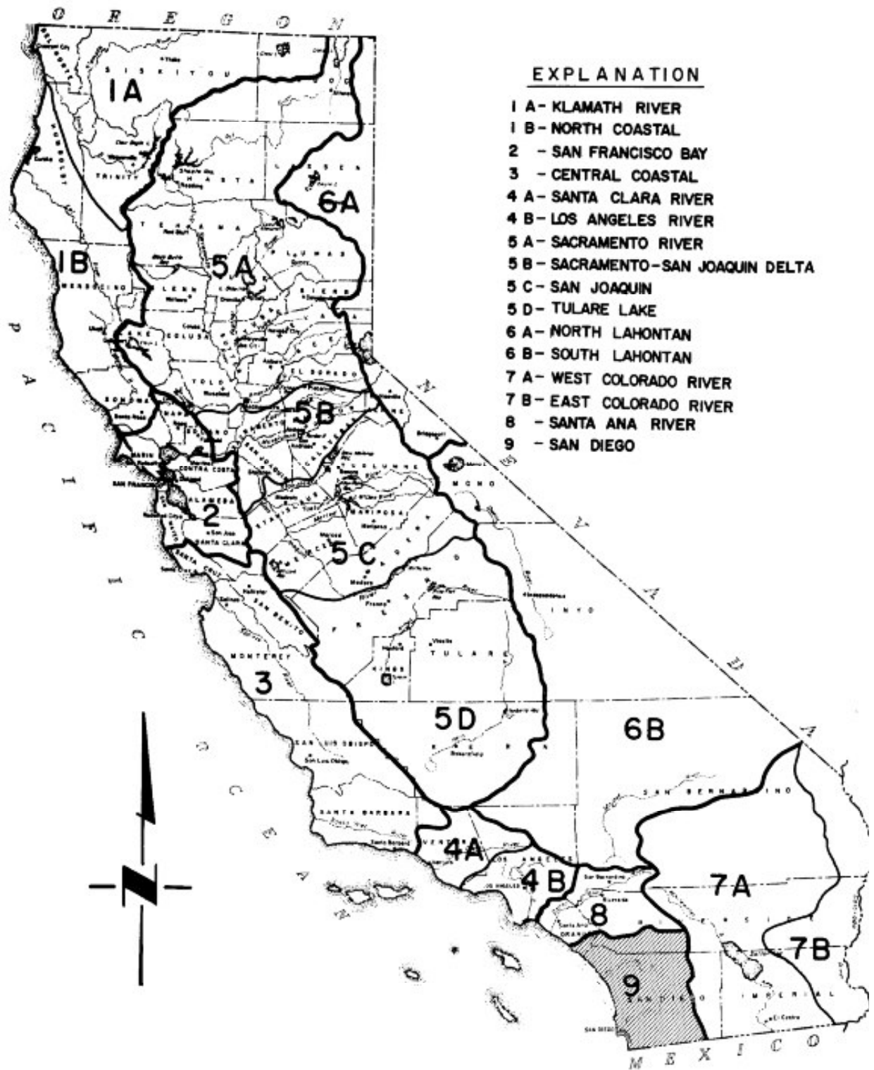
VICINITY MAP, BASIN PLANNING AREAS