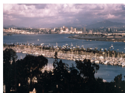
San Diego Bay

Based on the identification of "hot spot" areas during 1977 and 1978, intensive sampling of these areas was implemented in 1979. Such a sampling strategy was intended to confirm previous findings, establish the magnitude of the potential problem and identify pollutant sources. The program has since evolved to include transplanting Mytilus californianus mussels into select California bays and estuaries at selected sites to confirm potential toxic substance pollution (i.e., in the vicinity of dischargers).