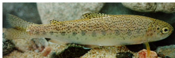
San Mateo Creek steelhead trout

Surveillance and monitoring at the State level is made up of three programs. These are the Toxic Substance Monitoring, State Mussel Watch and Bay Protection and Toxic Cleanup Programs.