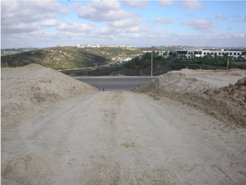
Photo 3 Example Of Exterior Slopes & Roadways Needing BMPs as Part of Action Plan (Facing West on College Ave)

Construction Storm Water Inspection-10/28/05 Carlsbad Municipal Golf Course, WDID# 937C337203 Carlsbad, San Diego County