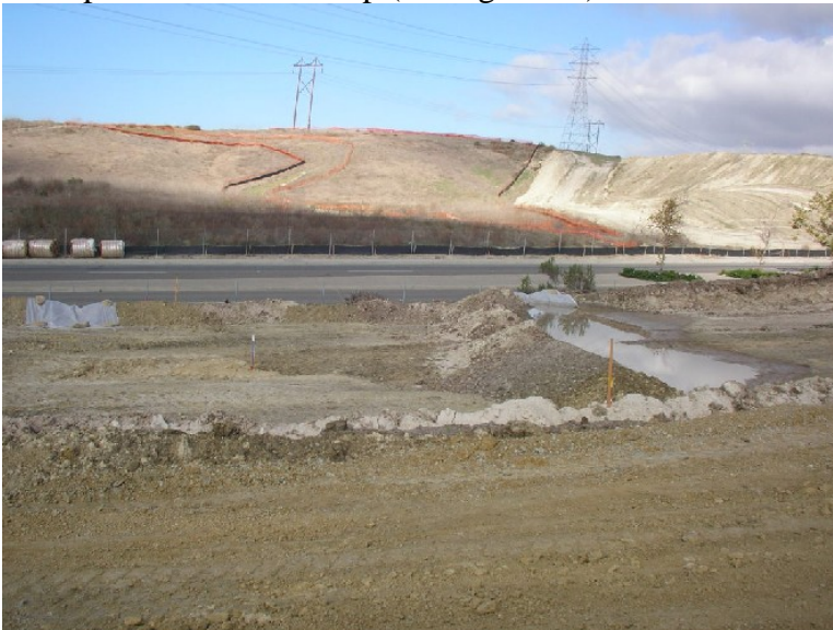
Photo 2 Example of New Silt Fence on Perimeter (Facing East on College)