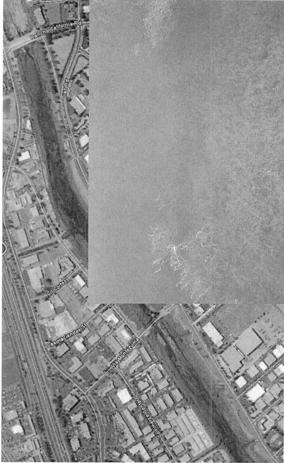
Figure 7. View of aquatic conditions