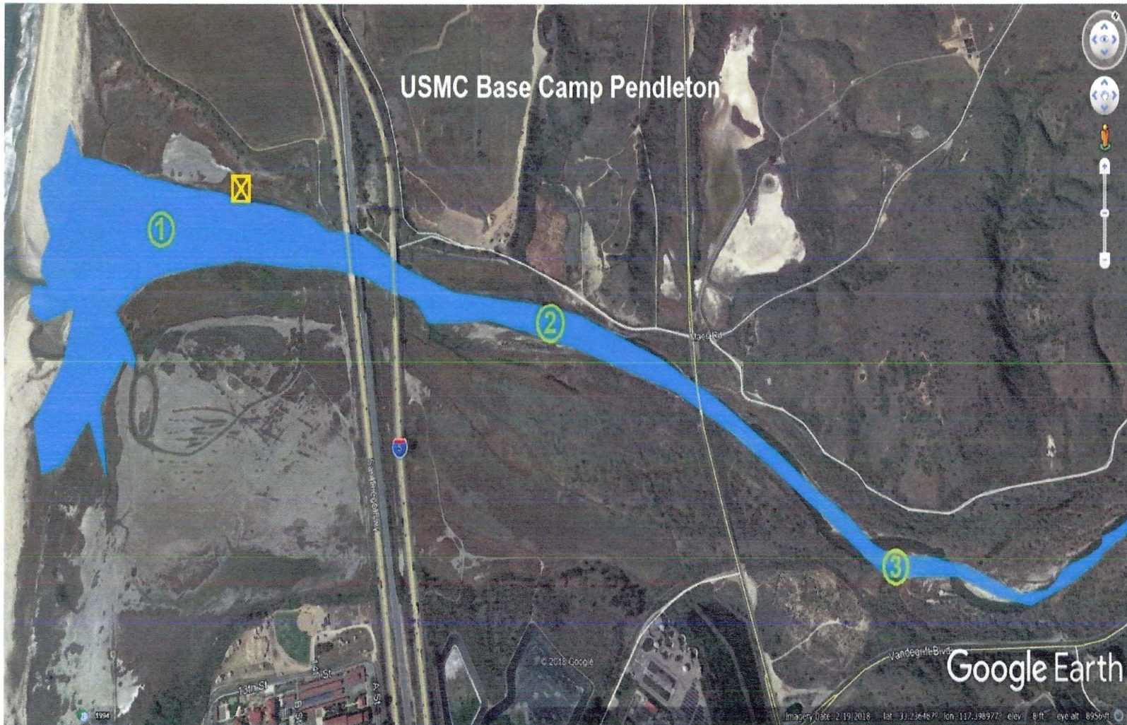
Figure 2. Santa Margarita River Estuary Surface Water Monitoring and Groundwater Monitoring Locations. Three Estuary segments to be monitored are indicated by green circles with numbers, the general location for surfacing groundwater monitoring stations are shown as gold-colored boxes with an “x” in the center.