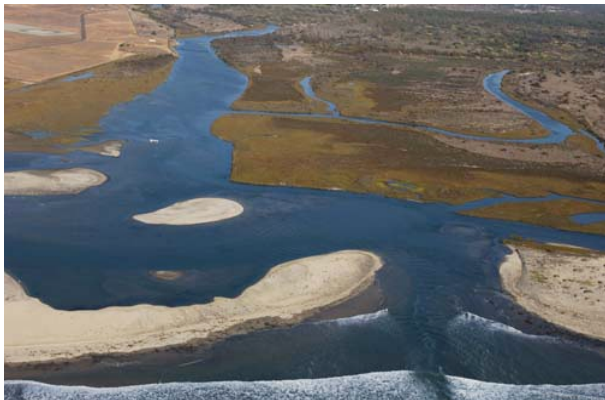
Tijuana River mouth

Copyright © 2002-2004 Kenneth & Gabrielle Adelman California Coastal Records Project www.californiacoastline.org