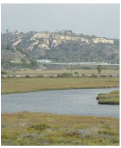
Los Penasquitos Lagoon

Estuarine Habitat (EST) - Includes uses of water that support estuarine ecosystems including, but not limited to, preservation or enhancement of estuarine habitats, vegetation, fish, shellfish, or wildlife (e.g., estuarine mammals, waterfowl, shorebirds).