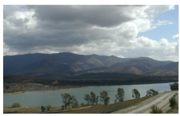
Lower Otay Reservoir