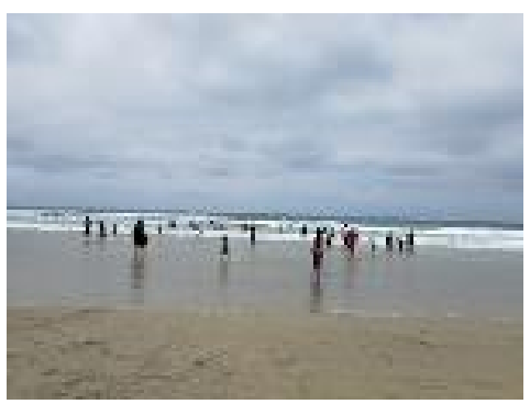
Begin proposed text Beachgoers in La Jolla End proposed text

Non-contact Water Recreation (REC-2) - Includes the uses of water for recreational activities involving proximity to water, but not normally involving body contact with water, where ingestion of water is reasonably possible. These uses include, but are not limited to, picnicking, sunbathing, hiking, beachcombing, camping, boating, tidepool and marine life study, hunting, sightseeing, or aesthetic enjoyment in conjunction with the above activities.