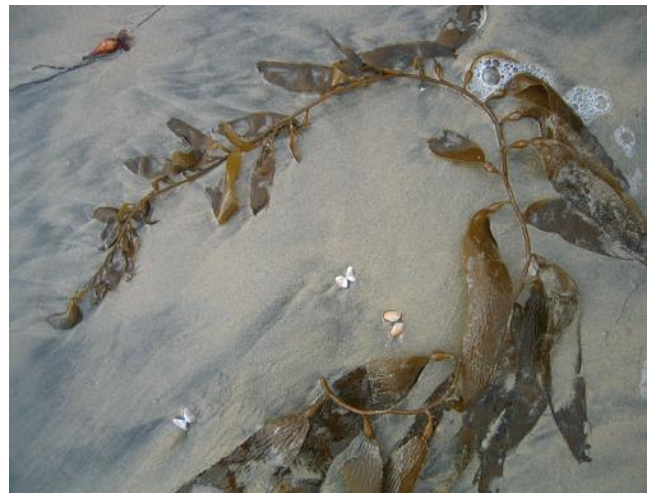
Kelp on beach at San Diego – La Jolla Ecological Reserve

Wildlife Habitat (WILD) - Includes uses of water that support terrestrial ecosystems including, but not limited to, preservation and enhancement of terrestrial habitats, vegetation, wildlife (e.g., mammals, birds, reptiles, amphibians, invertebrates), or wildlife water and food sources.