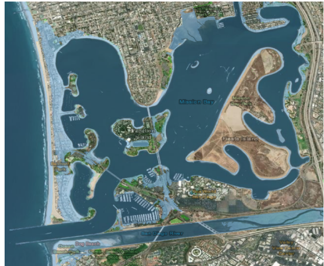
Figure 1. Areas of Mission Bay that are likely to flood with 3 feet of sea level rise during a 20-year storm event.

Sea level rise projections for the San Diego Region range from 2.5 to 10 feet by the year 2100 and could cause significant environmental and economic impacts. 13 For example, in Mission Bay, San Diego is poised to lose hundreds of millions of dollars of property and infrastructure as nearly all of Mission Beach and most of the shoreline around Mission Bay would be under water during a typical storm (Figure 1). The impacts and losses would be even more severe during a catastrophic once in a century storm.