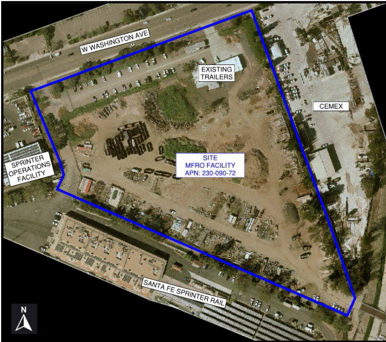
Figure 2. Facility map is from the ROWD. The Facility is located at 901 West Washington Avenue, Escondido, CA 92025.