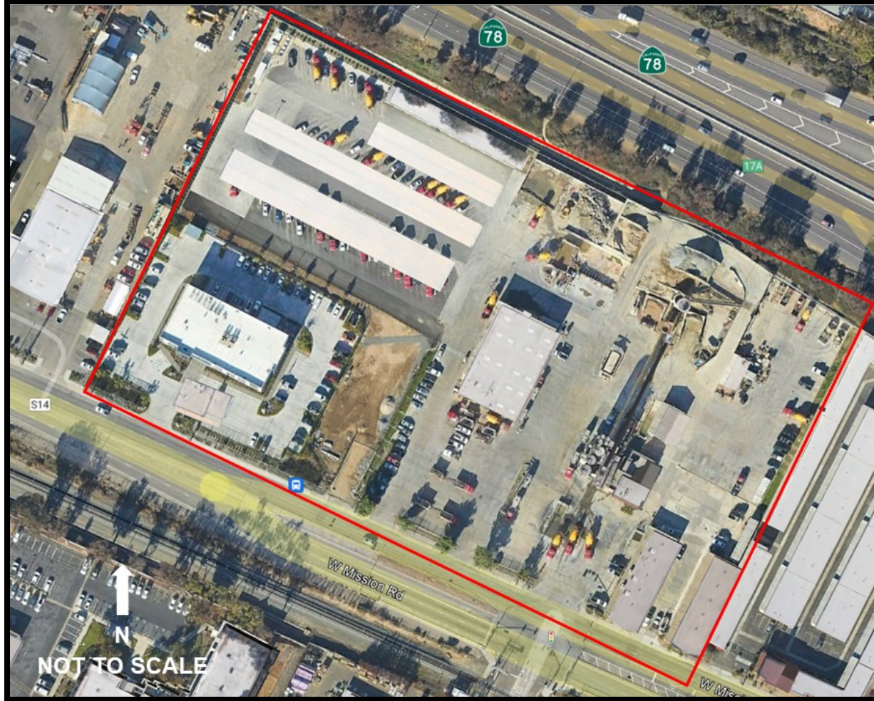
Figure 1.3 - Escondido Ready-Mix Concrete facility map.