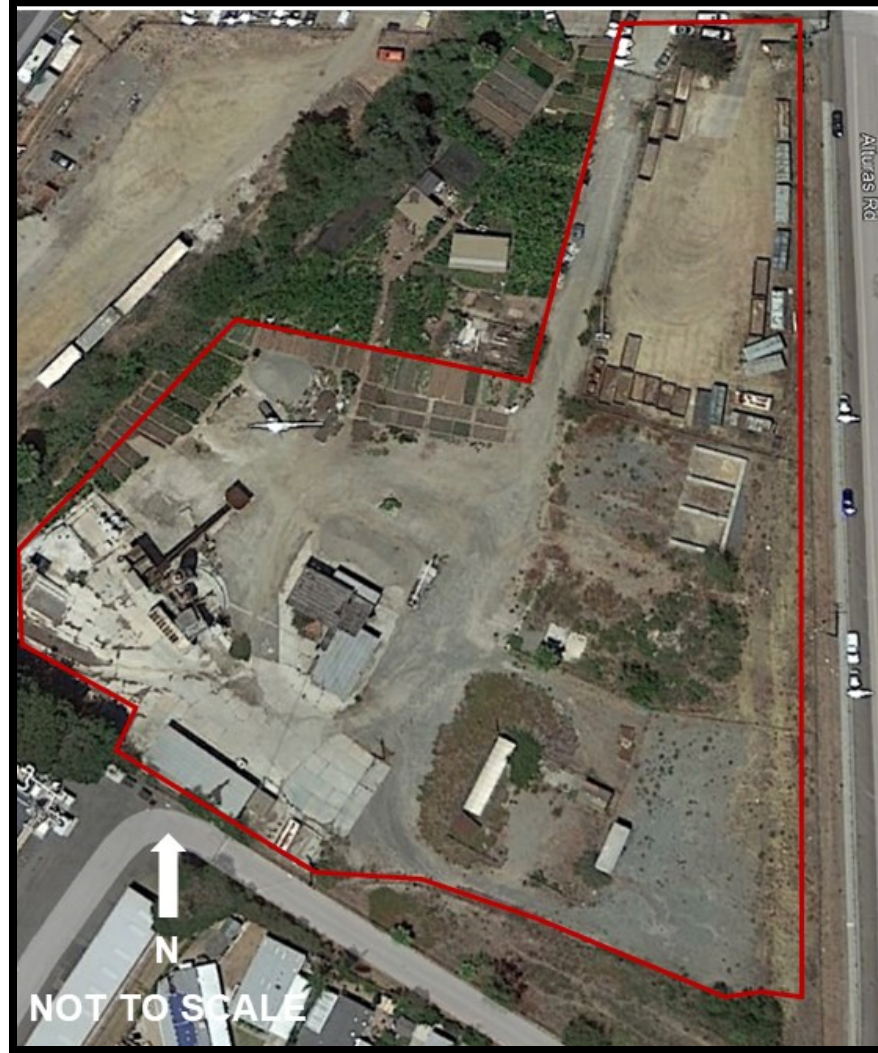
Figure 1.4 - Fallbrook Plant facility map. Latest satellite imagery available from August 2021 when facility was still active.