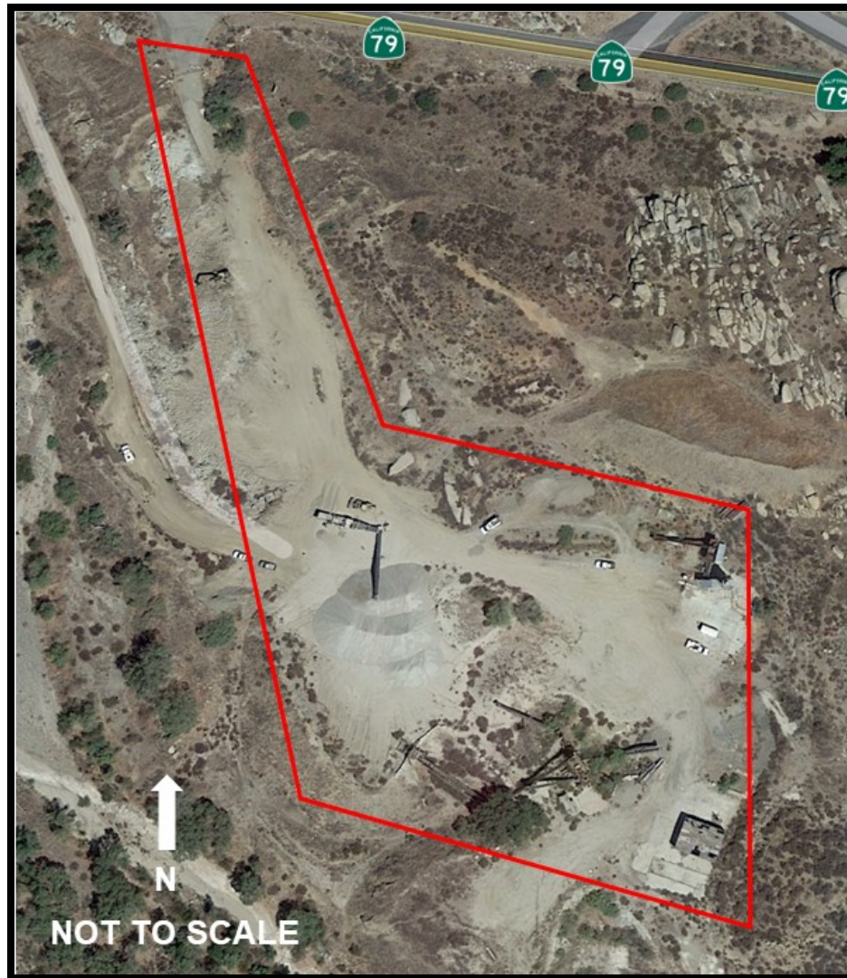
Figure 1.2 - Aguanga Sand Plant facility map. Latest satellite imagery available from August 2021 when facility was still active.