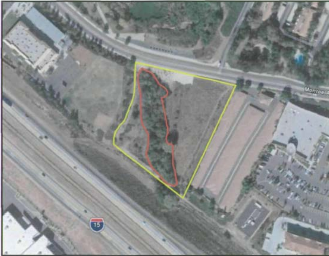
Photo 1 - Aerial photograph depicting the Cal Oaks Basin between Interstate 15 and Monroe Avenue, northwest of California Oaks Road.