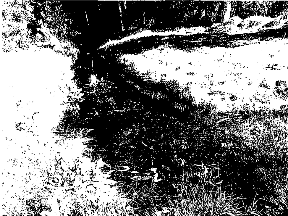
Photograph 1. North side of SR 76, looking at the disturbed wetland. Photo taken facing north.