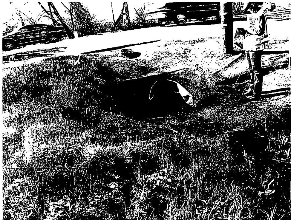
Photograph 2. North side of SR 76, looking at the inlet pipe. Photo taken facing south.