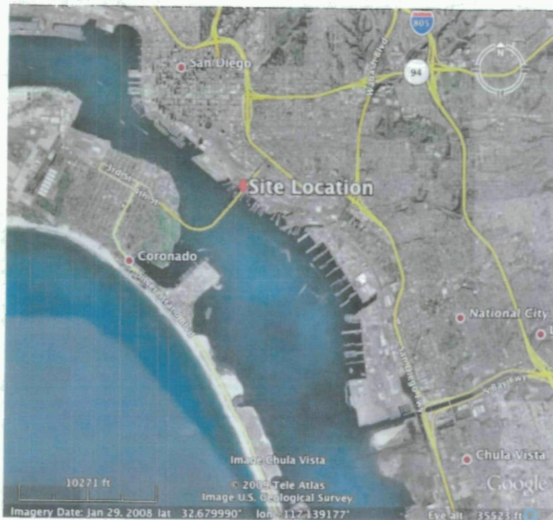
Figure 1. Location of Continental Maritime Pier 6 Dredging Project, Central San Diego Bay, CA.