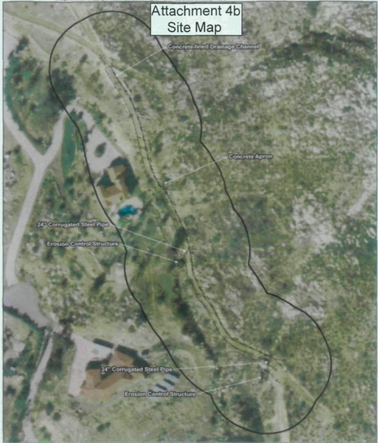
( flown January 2008)