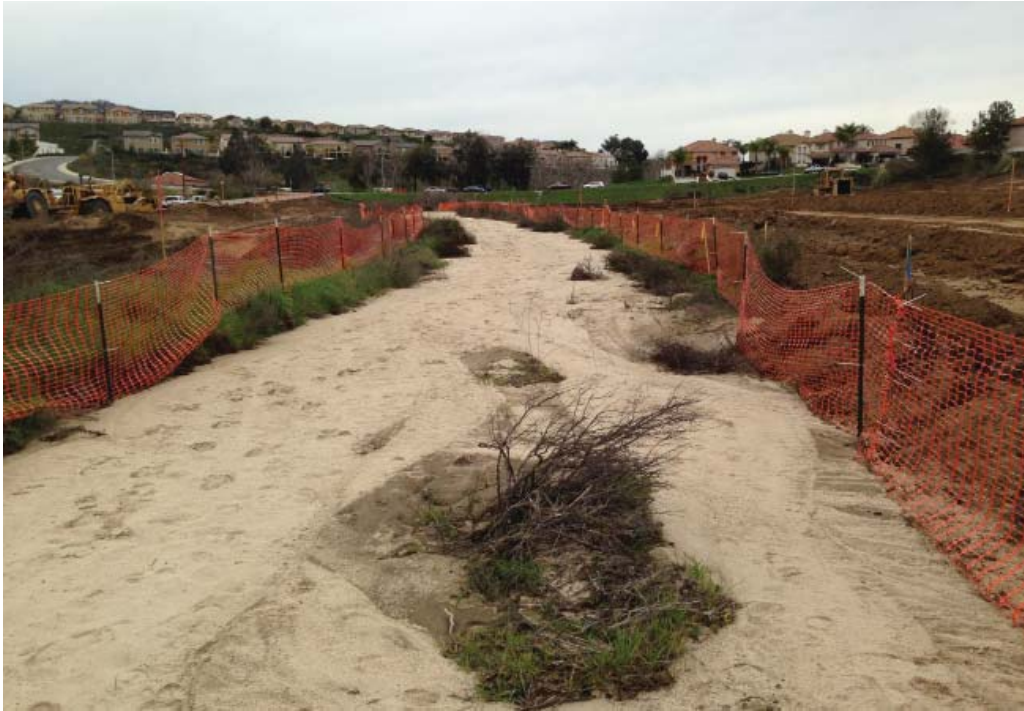
Section of channel designated for avoidance.