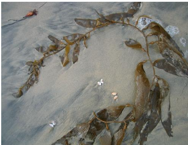
Kelp on beach at San Diego – La Jolla Ecological Reserve

Wildlife Habitat (WILD) - Includes uses of water that support terrestrial ecosystems including, but not limited to, preservation and enhancement of terrestrial habitats, vegetation, wildlife (e.g., mammals, birds, reptiles, amphibians, invertebrates), or wildlife water and food sources.