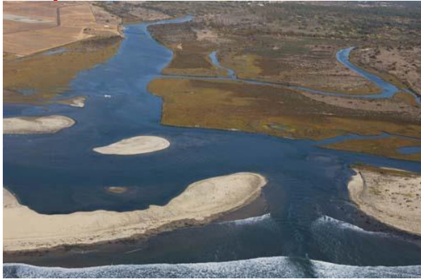
Tijuana River mouth