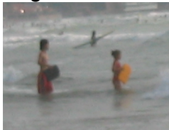
Beachgoers at La Jolla Shores