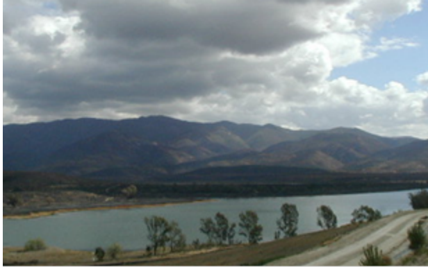
Lower Otay Reservoir