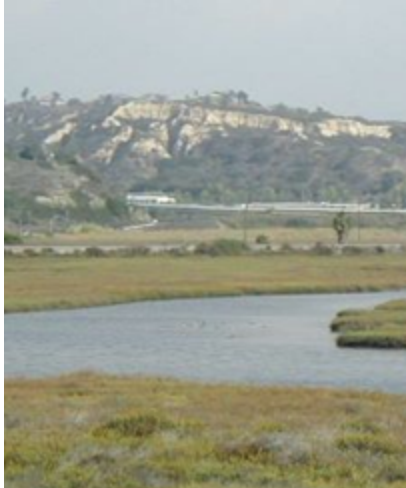
Los Penasquitos Lagoon

Estuarine Habitat (EST) - Includes uses of water that support estuarine ecosystems including, but not limited to, preservation or enhancement of estuarine habitats, vegetation, fish, shellfish, or wildlife (e.g., estuarine mammals, waterfowl, shorebirds).