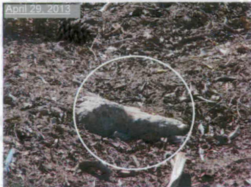
Photograph 11 – Green waste materials and concrete (circled) other debris