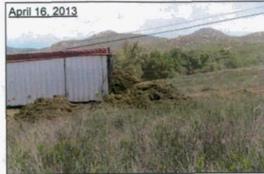
Photograph 6 5 – Waste discharged at Site No. 2

Figure 1 and photograph 7, and figure 2 and photograph 8 (provided below) illustrate the relative size and estimated coverage of wastes discharged to land at Sites Nos. 1 and 2, respectively.