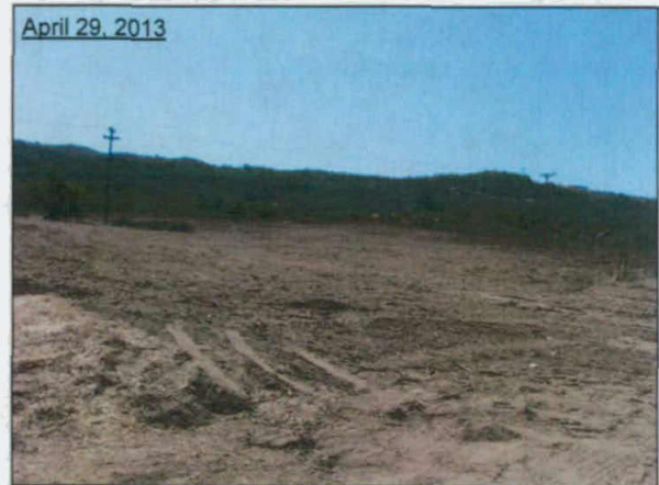
Photograph 8 – South-east facing view of Site No. 2

Wastes deposited at Sites Nos.1 and 2 consist primarily of green waste materials (i.e., landscaping wastes) and lesser quantities of glass, plastics, metals, and construction debris (see photographs 9 through 12 below). San Diego Water Board staff estimates the average thickness of the waste discharged at Site Nos. 1 and 2 is 2 feet, and covers an approximate area of 162 acres (Site No. 1, ~152 acres; Site No. 2, ~10 acres). Based on these values, the approximate total volume of waste discharged is 432,720 cubic yards.