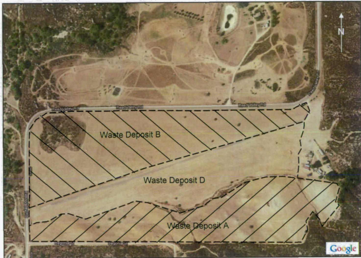
Figure 1 – Aerial view of Site No. 1 (~152 acres).

Figure 1 and photograph 7, and figure 2 and photograph 8 (provided below) illustrate the relative size and estimated coverage of wastes discharged to land at Sites Nos. 1 and 2, respectively.