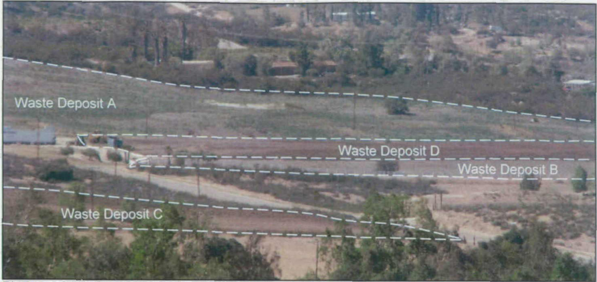
Photograph 7 – South facing view of Site No. 1.