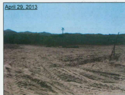
Photograph 4 – Waste discharged at Site No. 2