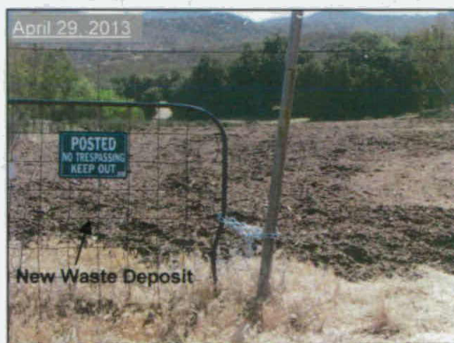
Photograph 3 –Waste discharged at Site No. 2