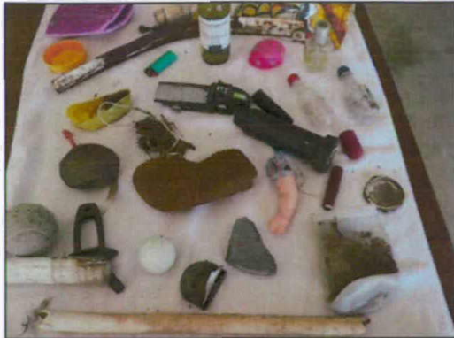
Photograph 9 – Various debris collected by the complainants from Site No. 1