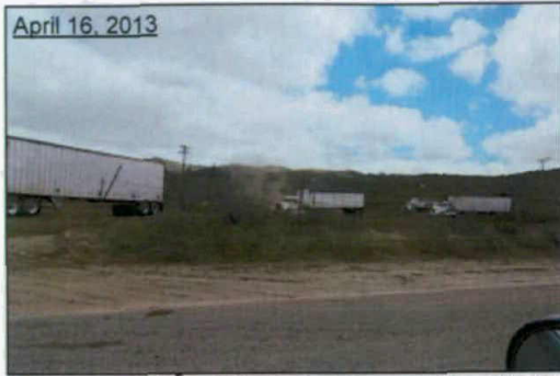
Photograph 5 5 – Waste haulers at Site No. 2