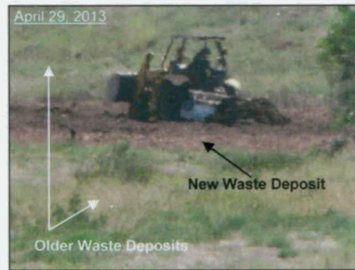
Photograph 2 – Spreading waste at Site No. 1