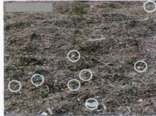
Photograph 10 – Green waste materials and various plastics (circled)