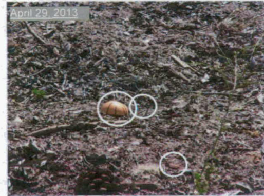
Photograph 12 – Green waste materials and various plastics (circled)