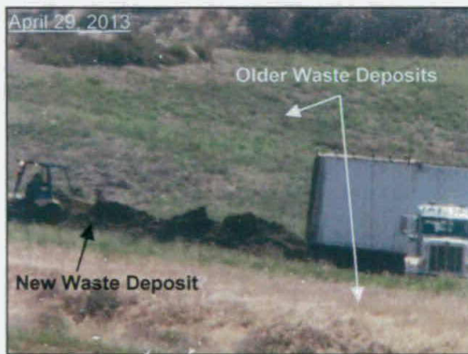
Photograph 1 –Waste discharged at Site No. 1

During the April 29, 2013 inspection of Sites Nos. 1 and 2, San Diego Water Board staff observed wastes actively being discharged to land (see photographs 1 and 2 below) at Site No. 1, and visual evidence supporting complainant allegations that wastes have been discharged at Site Nos. 1 and 2 since August 2011 (see photographs 3 through 6 below).