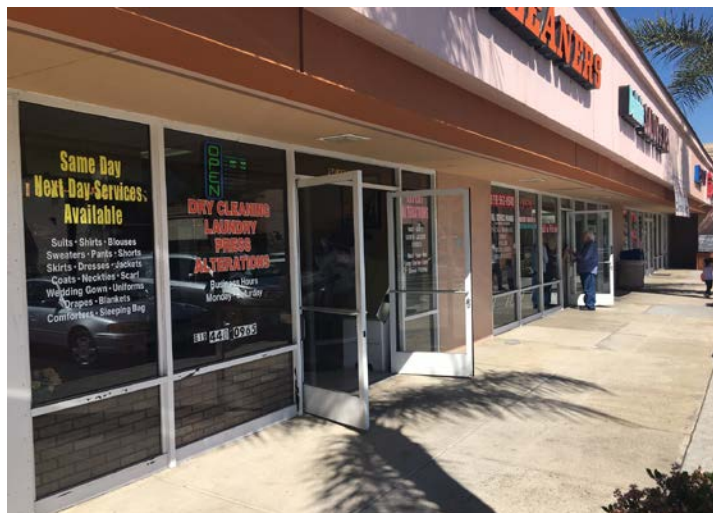
Photograph taken March 30, 2017, showing the doors to Style Cleaners open during the indoor air sampling event.

Doors were open during the collection of indoor air samples. Ms. Sarah Mearon of the San Diego Water Board visited the site on March 30, 2017, during the sampling event, and noted that the front doors of the suite were propped open, as shown in the below photograph. The Indoor Air Sampling Report 2 also notes that, “the rear and front doors of the Style Cleaners were opened periodically to provide indoor cooling for periods of 10 minutes to 30 minutes throughout the day.” Having doors open during collection of the indoor air samples renders the data invalid because the samples were not collected under “worst-case” conditions and are inadequate to characterize the risk to human health.