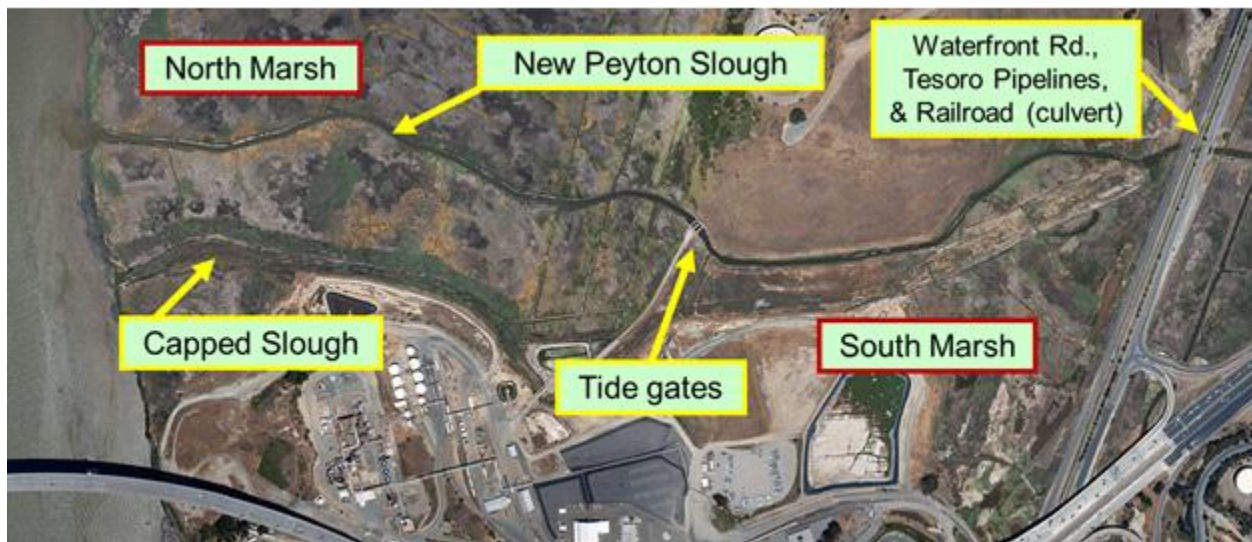
Photo 1a. Aerial of Rhodia and marshes.

Board staff recently attended the Sixth Annual Interested Party Meeting, held by Rhodia, Inc., at its Martinez plant. The meeting provided an update to stakeholders on the progress of cleanup and restoration of legacy copper and zinc contamination in Peyton Slough and wetlands on Rhodia's property (Photo 1a). The contamination is from a copper ore processing facility, which operated at this location from 1896 to 1966.