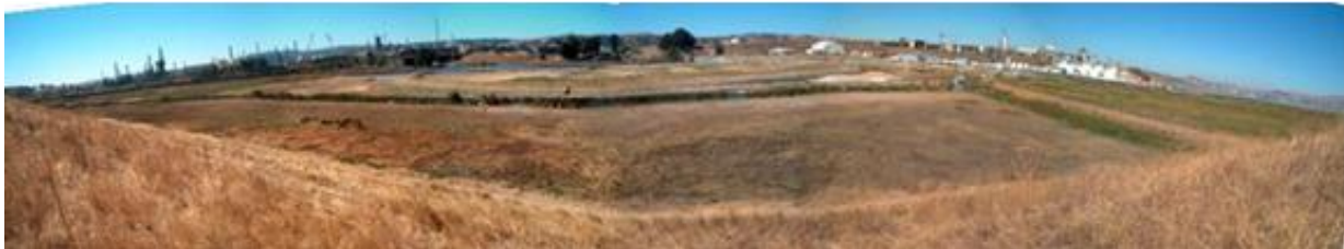
Photo 1b. South marsh before construction and tidal inundation (2004).

After successfully cleaning up and relocating Peyton Slough, the focus of the cleanup has turned to restoring the surrounding marsh areas. To guide this effort, the Water Board established performance criteria. While native vegetation criteria have been met in the north marsh area, the south marsh area is proving to be more of a challenge, due to a lack of water (Photo 1b). This lack of water is largely caused by Rhodia's recent inability to optimally operate the tide gates to flood the marshes. While Rhodia has been working closely with neighbors to improve tide gate operations to meet multiple objectives, flooding of the south marsh is hindered by the periodic inundation of Waterfront Road and Tesoro's pipelines, which cross the south marsh. Water Board staff are working with Tesoro and Contra Costa County, which owns Waterfront Road, to find a solution that will allow optimal operation of the tide gate and support restoration of the south marsh area.