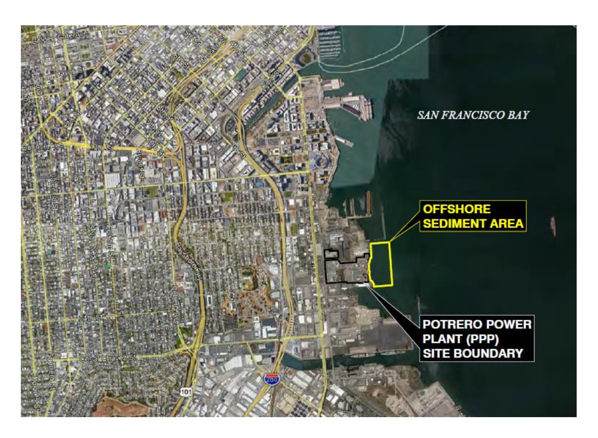
Figure 1 – Site Location Map

Redevelopment: California Barrel Company has completed all entitlements for developing the Site into a mixed-use project consisting of 13 development blocks. The project will include 2,650 residential units, of which 30% will be affordable housing; commercial space; a hotel; several parks, plazas, and open spaces; and a roof-top soccer field. Construction will be in phases over a 16-year time period beginning in 2020 and ending in 2035.