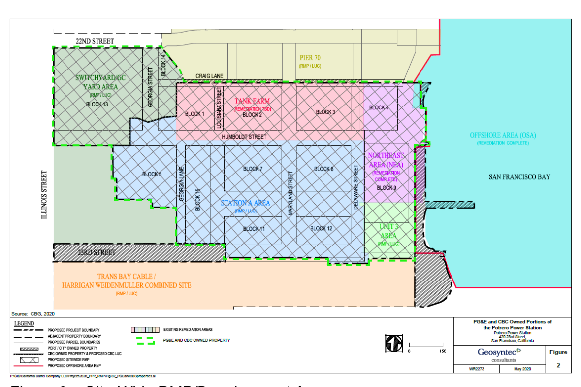
Figure 3 – Site-Wide RMP/Development Area

Approximate boundaries shown. Map not to scale