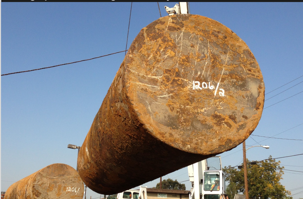
Photograph 1: UST being removed by a crane

Source: Data shown in Table 13 were exported from the GeoTracker Cleanup Sites Data Download on 7/17/2017 (Available at: https://geotracker.waterboards.ca.gov/datadownload ) except for Case Begin Dates which were exported from GeoTracker Advanced Case Reporting Tool captured 7/17/2017.