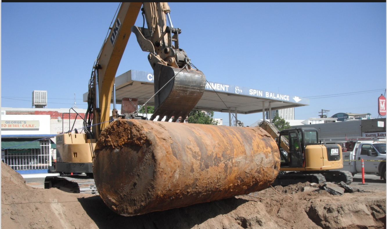
Photograph 1: UST being removed by a track-mounted excavator

Source: Data shown in Table 13 were exported from the GeoTracker Cleanup Sites Data Download on 1/17/2016 (Available at: https://geotracker.waterboards.ca.gov/datadownload ) except for Case Begin Dates which were exported from GeoTracker Advanced Case Reporting Tool captured 1/17/2017.