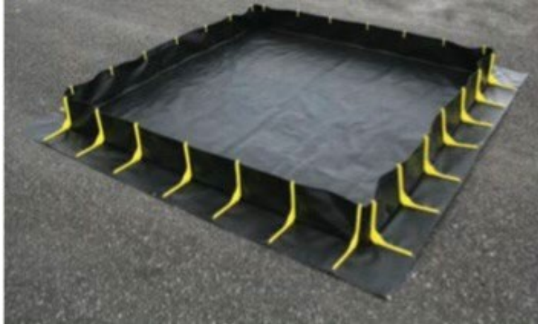
Figure 4 Example Equipment Refueling Containment Area

Construction staging of equipment and materials would occur within the boundaries of the project site. Larger equipment (e.g., water tank) would be assembled on site. Equipment refueling would occur on site in a containment area; an example containment area is shown in Figure 4.