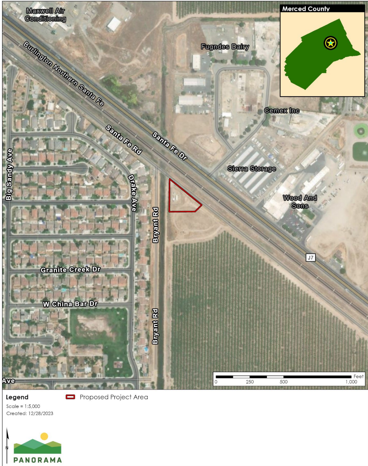
Figure 2 Project Location