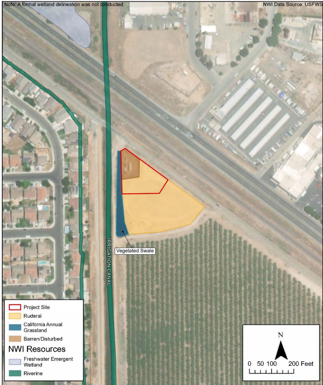
Project Site Habitats