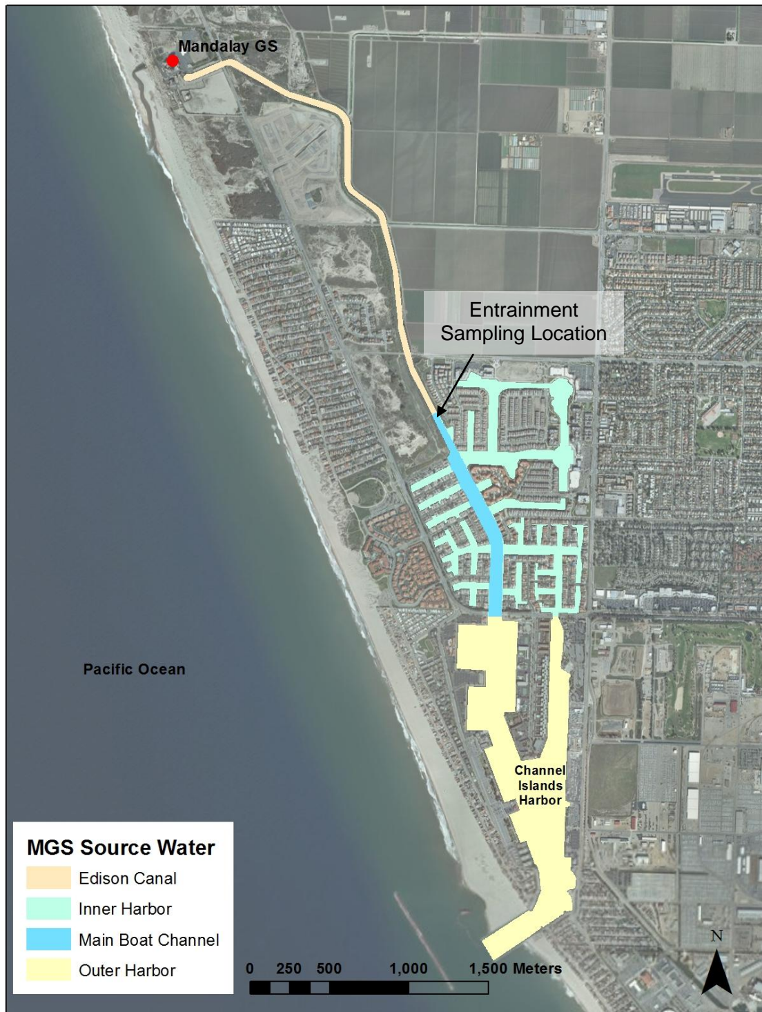
Figure 1. Mandalay Generating Station source water area based on NOAA, USACE, and GIS data and proposed entrainment sampling location.