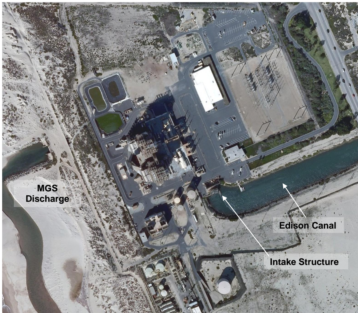
Figure 2. Mandalay Generating Station plant site and intake area.