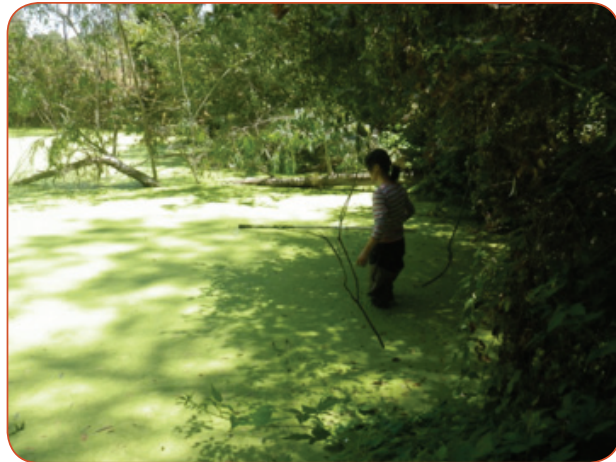
Cyanotoxin sampling in depressional wetlands (Photo courtesy of M. Baroldi).

Cyanotoxins are an emerging contaminant of concern that may potentially impact many beneficial uses of water, including aquatic life, recreation, and water supply. The study will determine the extent and occurrence of cyanotoxins, and will provide evidence of their impact to surface waters in the San Diego region. The results from the study will help decision makers better assess the threat of cyanobacteria blooms and cyanotoxin production. It will also help water quality managers carry out informed management actions to reduce sources of cyanotoxins and improve water quality.