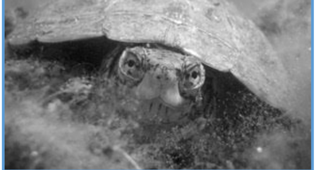
Western Pond Turtle ( Actinemys marmorata ) from Coyote Creek, Santa Clara County.