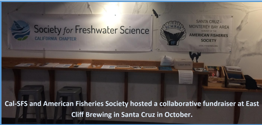
Cal-SFS and American Fisheries Society hosted a collaborative fundraiser at East Cliff Brewing in Santa Cruz in October.