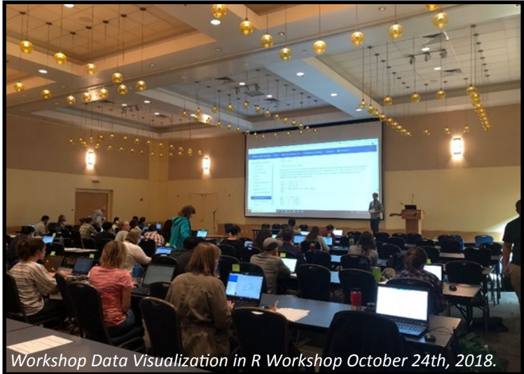
Workshop Data Visualization in R Workshop October 24th, 2018.

A special session held the day before the workshop also featured several talks on how data visualization and mapping can enhance the utility of bioassessment data. Many of these talks featured how to use R to bridge the research-management divide.