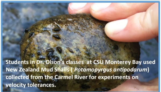
Students in Dr. Olson's classes at CSU Monterey Bay used New Zealand Mud Snails ( Potamopyrgus antipodarum ) collected from the Carmel River for experiments on velocity tolerances.