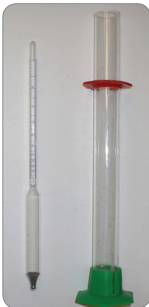
Figure 1: Hydrometer and 150 mL graduated cylinder used to check sample preservation levels.