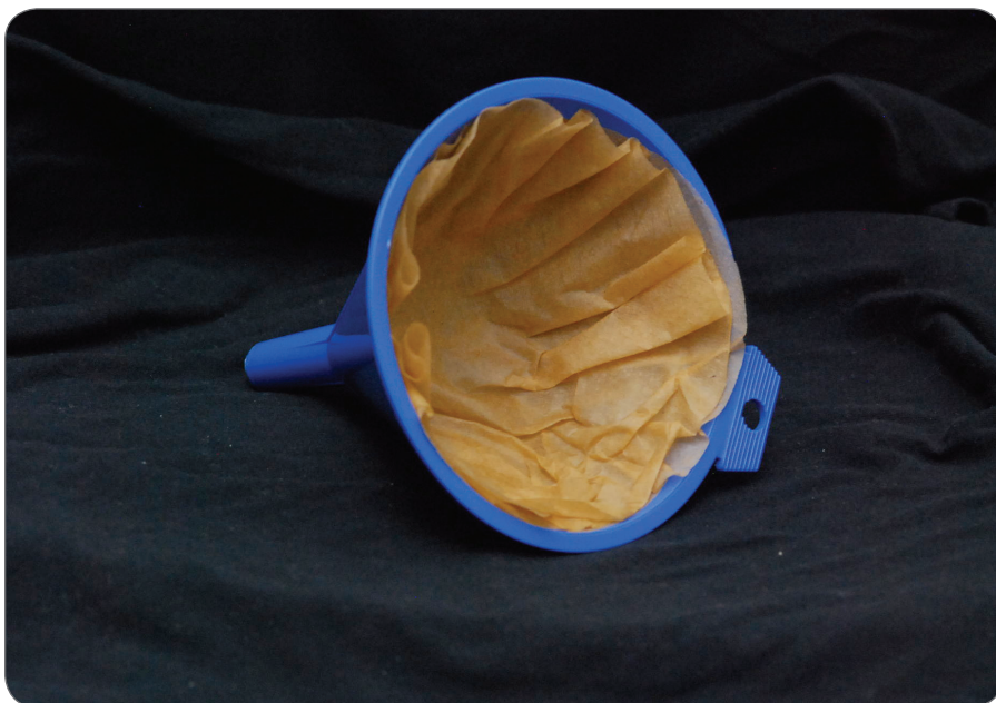
Figure 2: Example of filtered funnel used to keep particulates out of the waste stream.

Step 4. Float the hydrometer in the graduated cylinder.