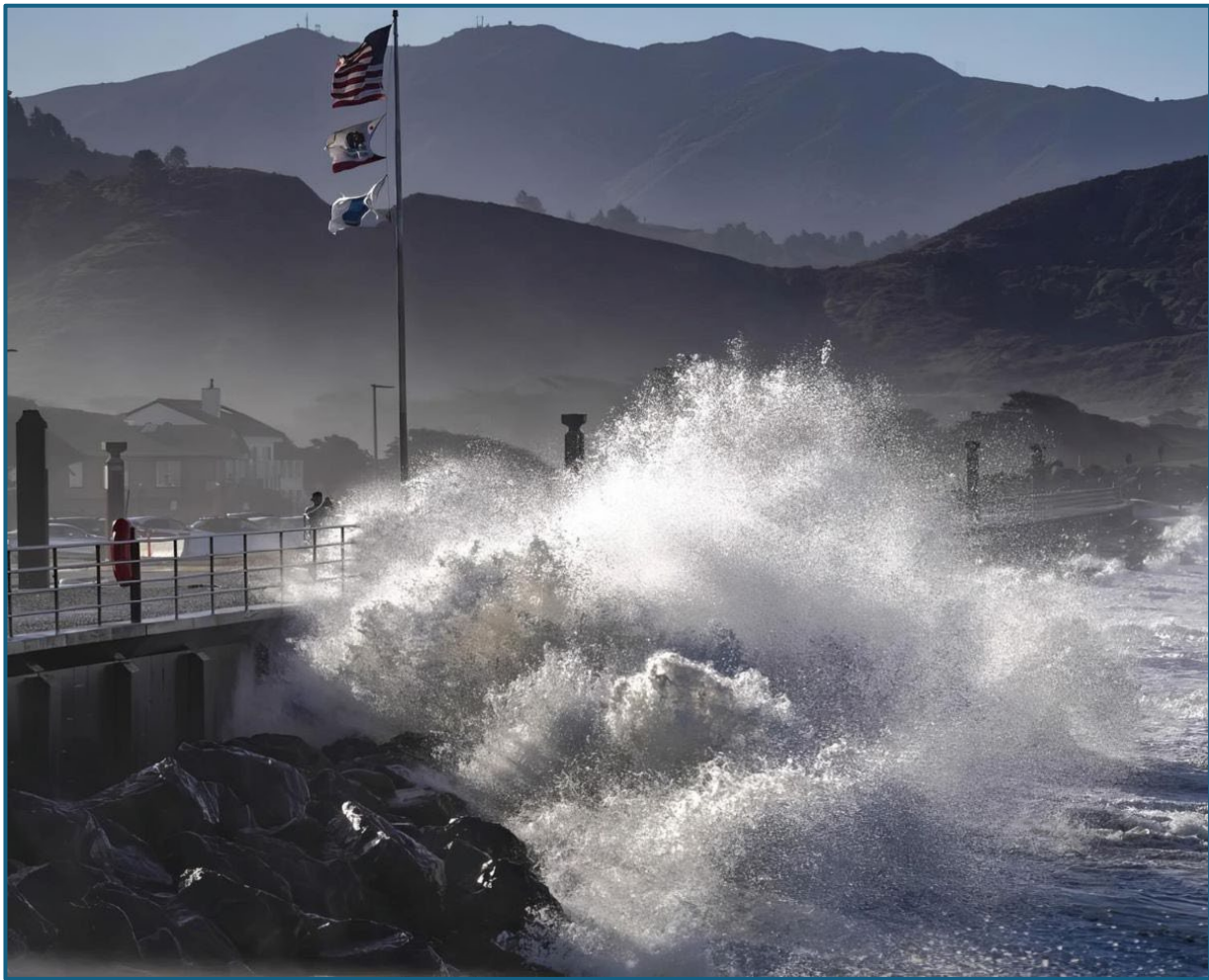
King Tides at Pacific Pier