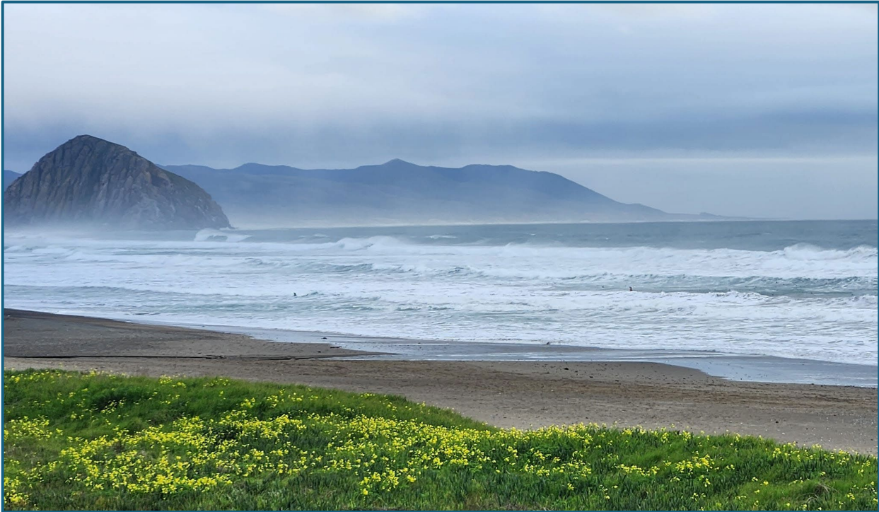
Morro Strand State Beach & Morro Rock