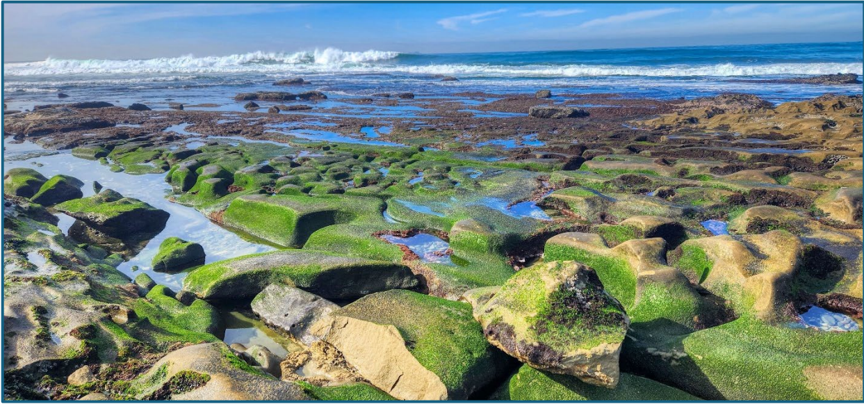
La Jolla Tide Pools