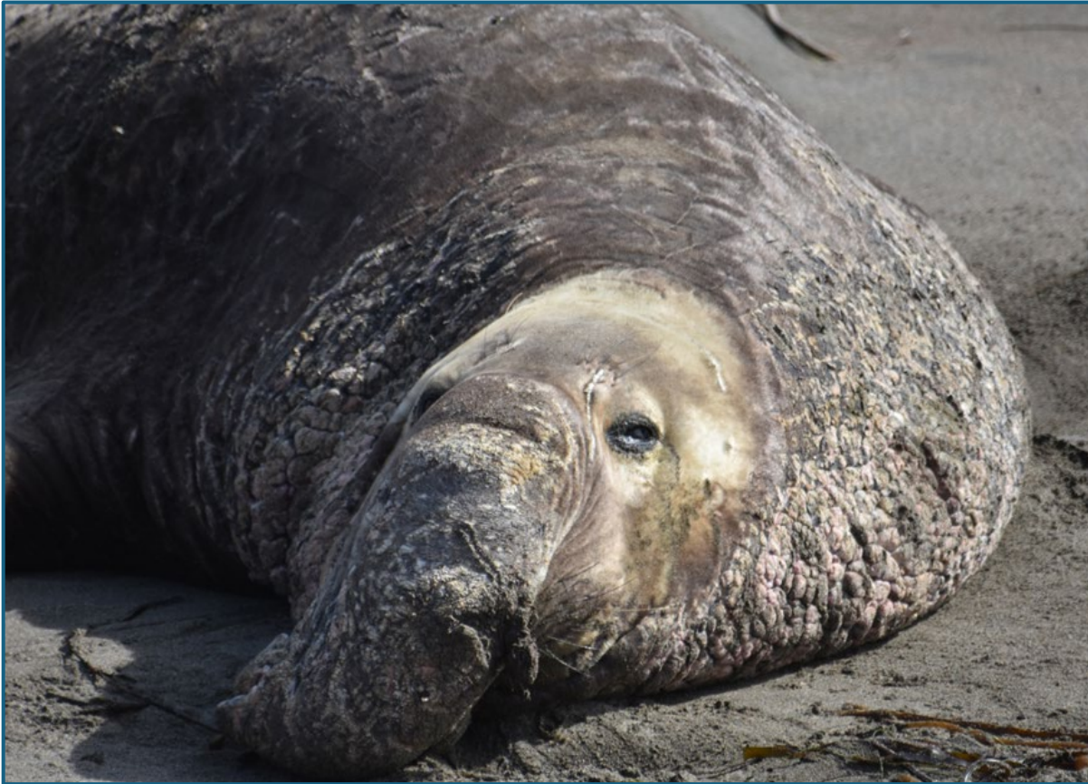
Elephant Seal at Piedras Blancas