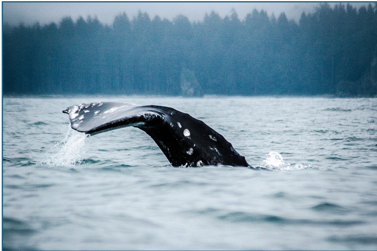
Gray whale along the California coast