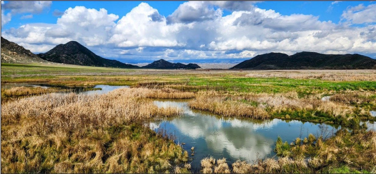
Wetland at San Jacinto Wildlife Area