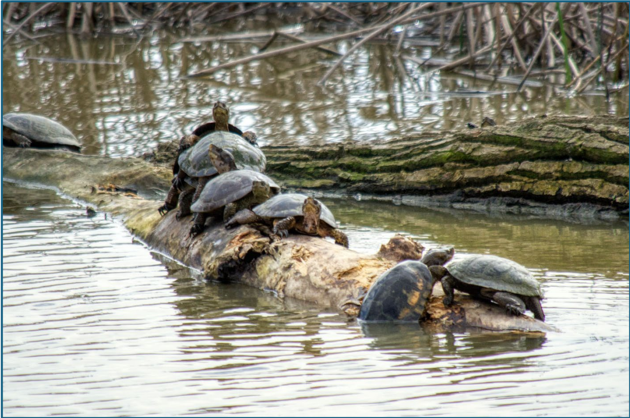
Western Pond Turtles