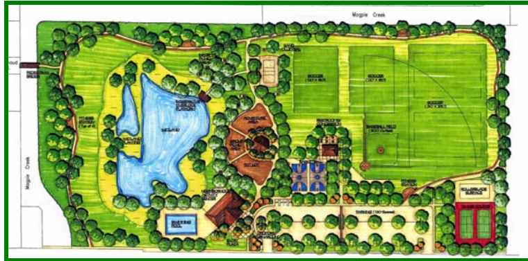
The Robla Community Park – Master Plan

Hundreds of people had stopped by, visited for a while, validated our efforts, and learned more themselves. Others in our community realized our (happy but large crowd) challenges and chipped in to help us spread the word about preventing water pollution. Together we got our important messages out to the public.