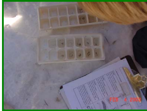
Sorting macro invertebrates from the Upper Truckee River

Meyers Elementary School is situated at the southern end of the Lake Tahoe watershed approximately one half mile from the Upper Truckee River, which supplies 40% of the water flowing into Lake Tahoe. It is surrounded by a mix of forests, meadows, and residential