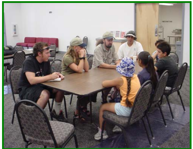
Day Two – The Water Testers are getting an explanation of WHY they are testing the water and WHAT the results of the tests will mean.

Day Two concluded with an exercise in instrument calibration. The State and Regional Water Board staffs brought equipment that ranged from the simple to the more complex. Correct calibration methods were discussed and demonstrated. Suggestions were also provided for more effective use of our own equipment.