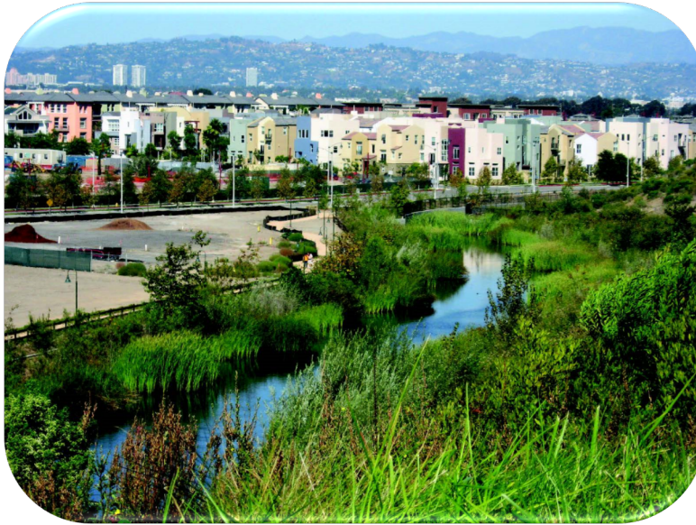
Urban stream near the southern California coast