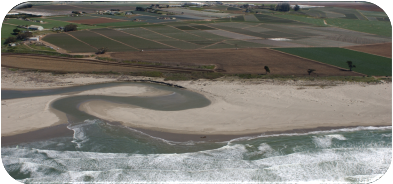
Pajaro River in central California.

On a statewide basis, watersheds with greater than 10% urban land cover had consistently higher sediment pollutant concentrations and toxicity than did watersheds characterized by agricultural or other land cover types. Metals, industrial compounds, DDTs, and pyrethroid pesticides were all found at significantly higher concentrations in urban streams. This pattern is evident at the statewide level, but other local and regional studies have previously shown that pollution levels and toxicity can be strongly related to agricultural and other land uses in specific areas. This is because the “agricultural” land use category used in the SPoT analysis is comprised of many different types of crops and farming practices, and the amount of polluted runoff from these lands varies depending on the types of practices employed.