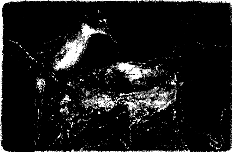
Figure B. Flycatcher 6

of its length, but children age 2 to 14 are regularly observed bathing in the Creek during hot afternoons. On a peaceful Sunday afternoon, families of ducks can also be observed frolicking at many points on the creek. The bicycle path, shaded in places by riparian trees, along the creek is used extensively.