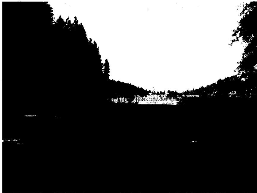
Photo No. P1010097.jpg – October 2003 View north from well, showing Lake Gregory in the distance