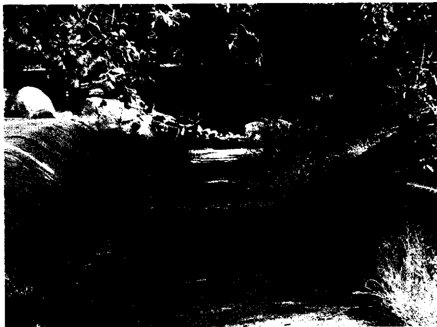
Photo No. P1010076.jpg – October 2003 South of well, showing culvert under road and improved streambed