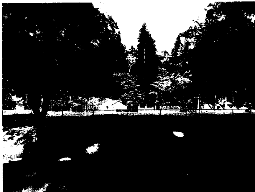
Photo No P1010098 – October 2003 View east from well, showing improved stream bed and softball fields