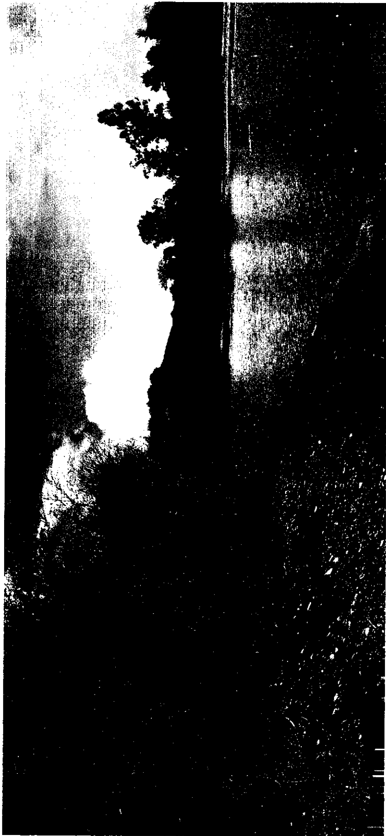
Upstream of Fitch Well #5 (Application 13217) Photo Date 3-20-2003