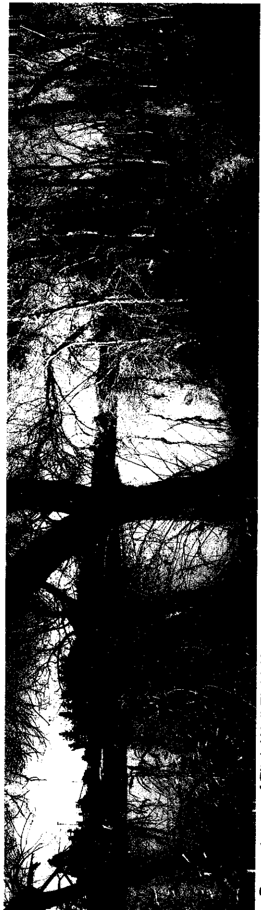
Downstream of Fitch Well Field (Application 13217) Photo Date 3-20-2003