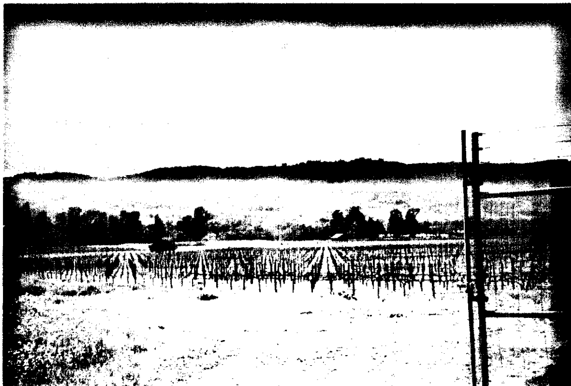
Typical Place of Use overlooking reservoir