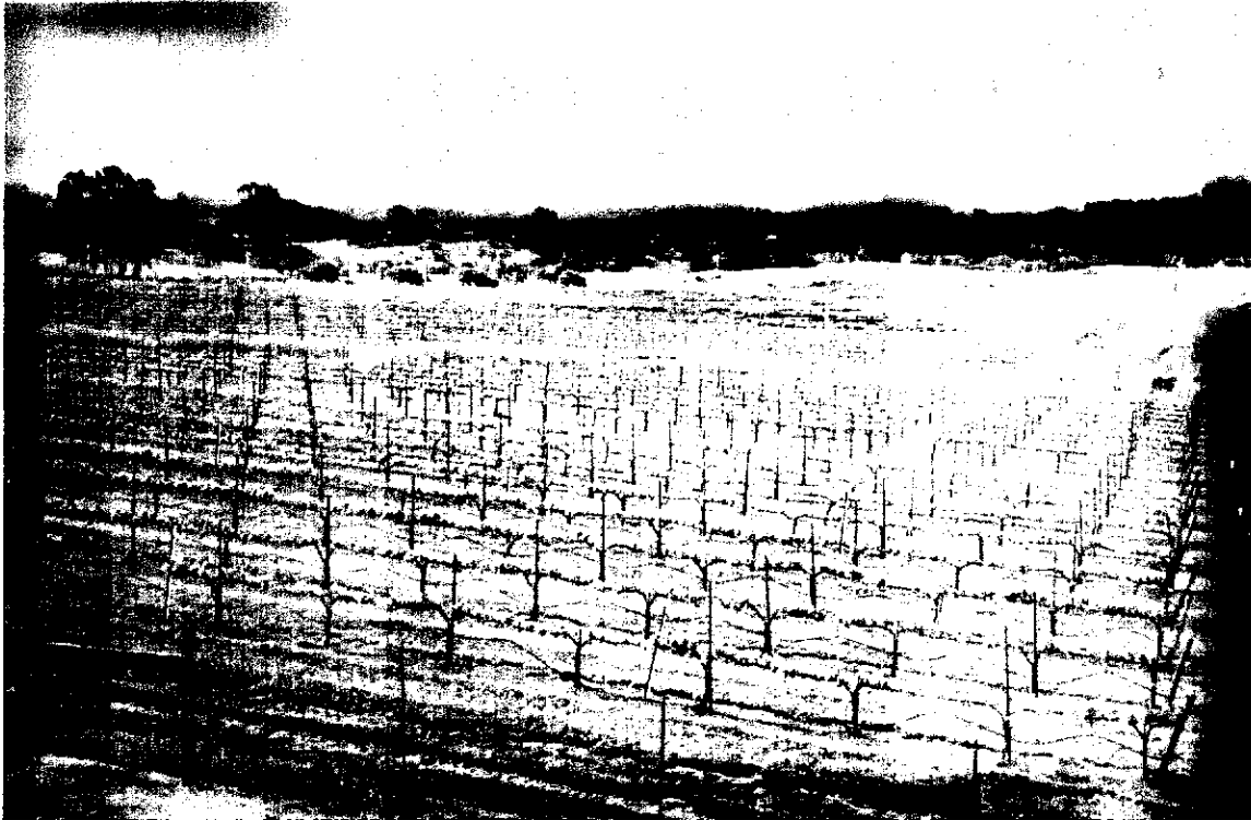
Existing Place of Use – Proposed Place of Use (at right side of photo)