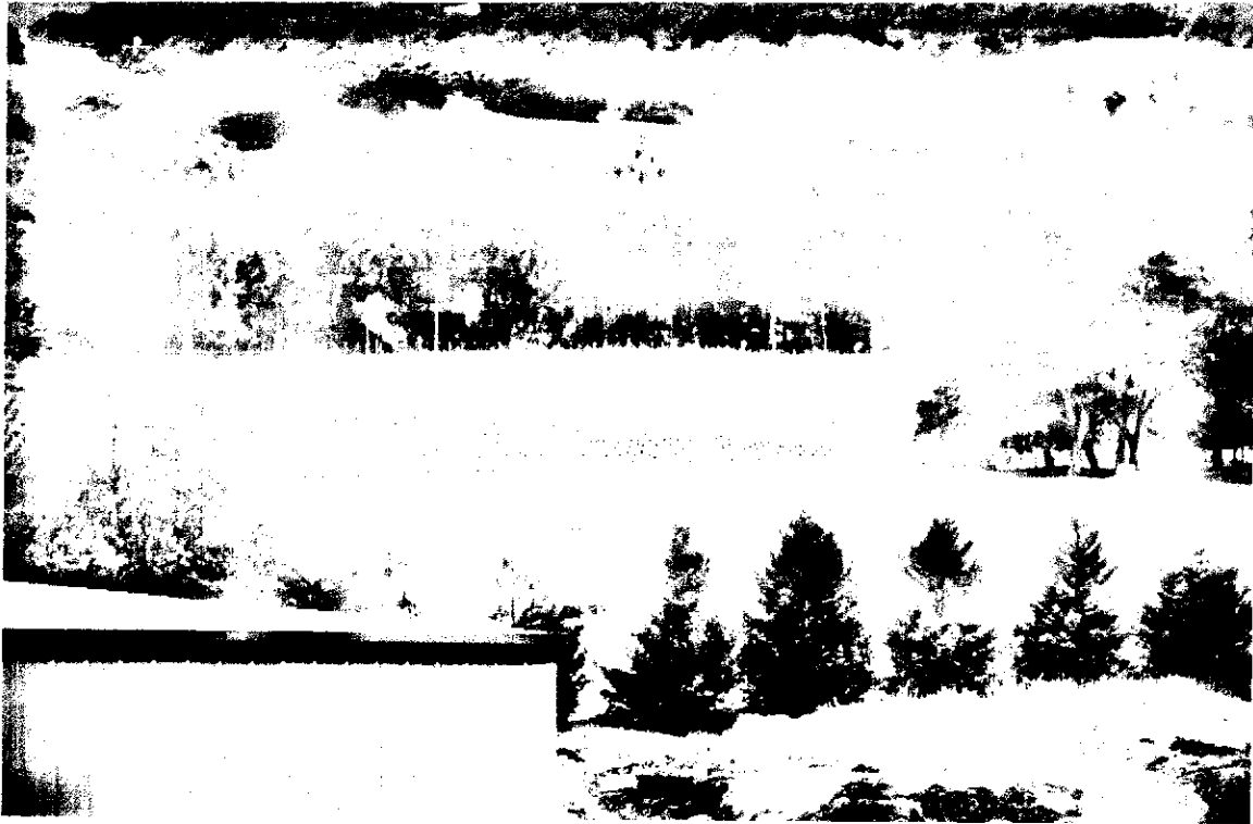
Existing Place of Use