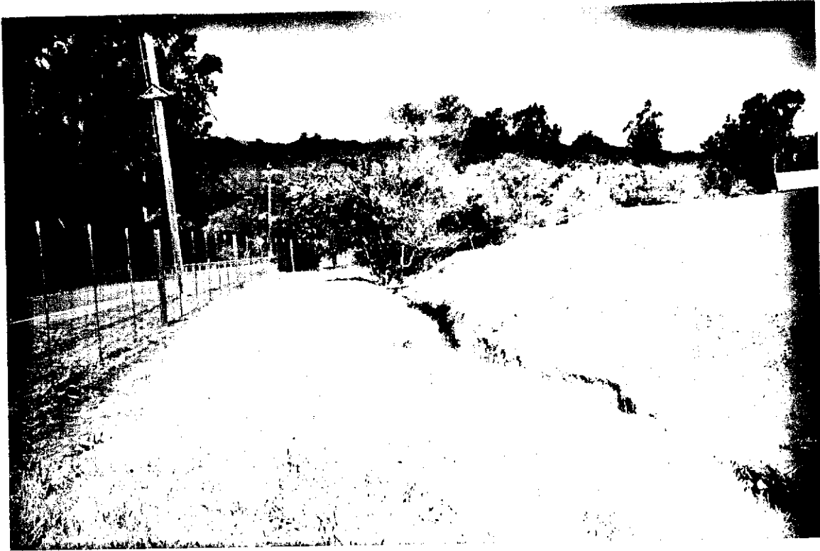
POD #1 - looking downstream