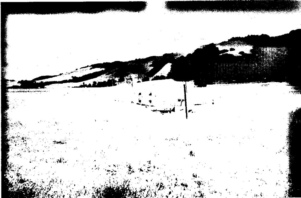
POD #1 – view of spillway