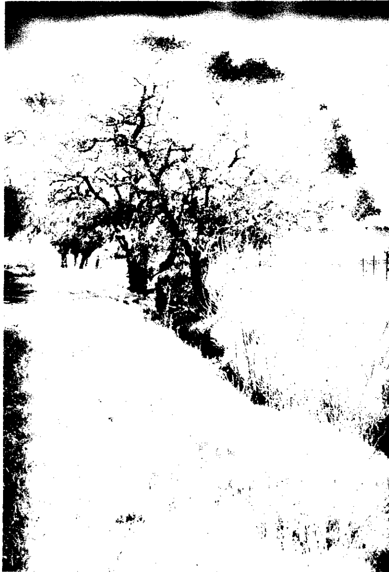
POD #1 looking upstream