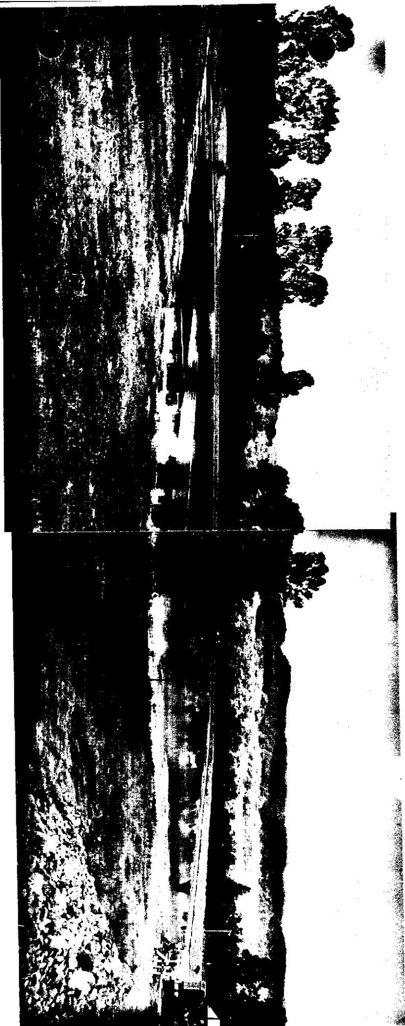
Reservoir at POD #1