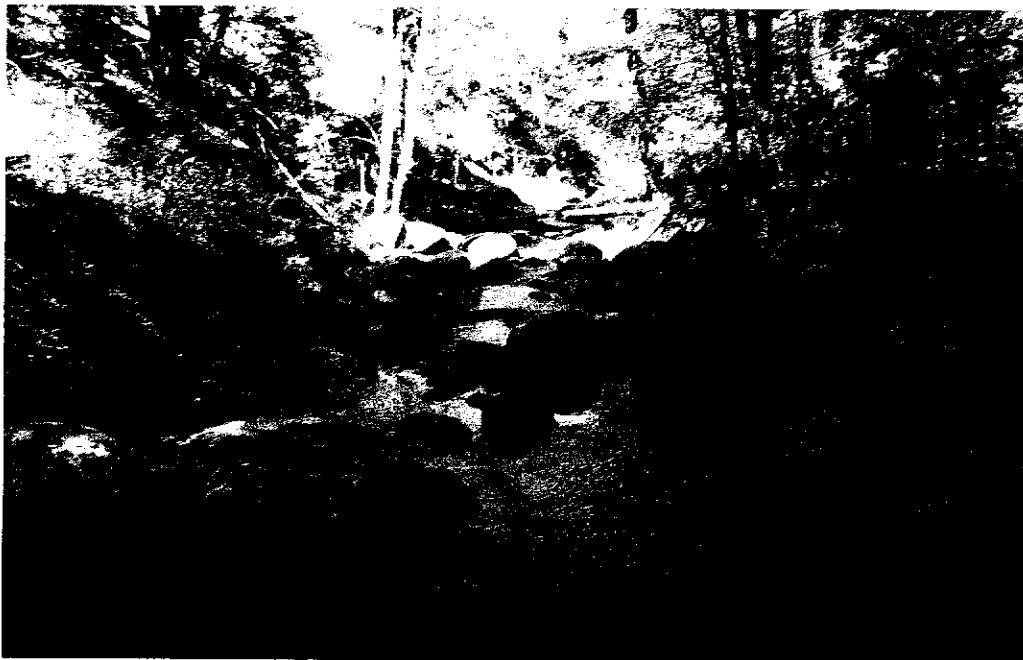
Looking downstream from Darbee Ditch diversion dam