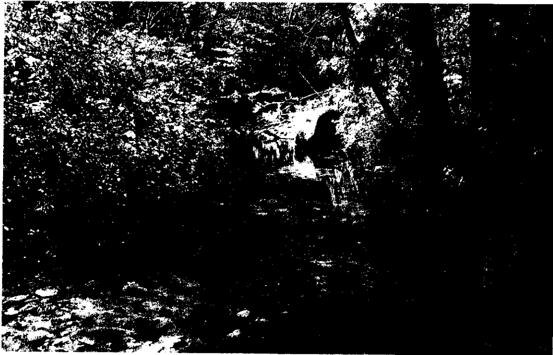
At Gage site below Darbee Ditch