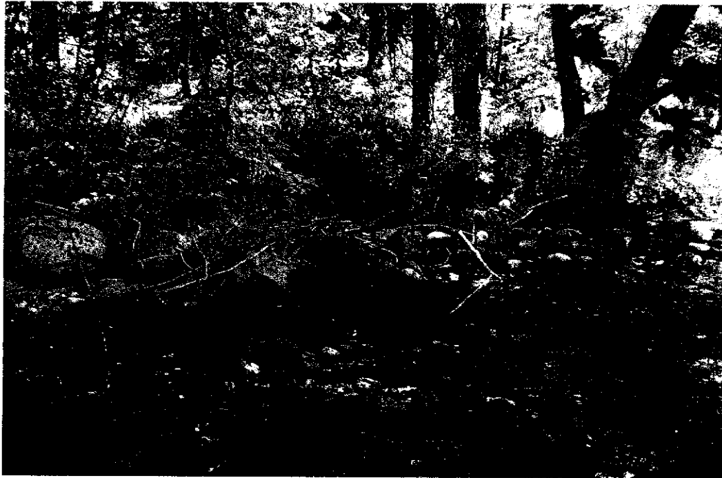
From left bank looking at head of Fay Ditch