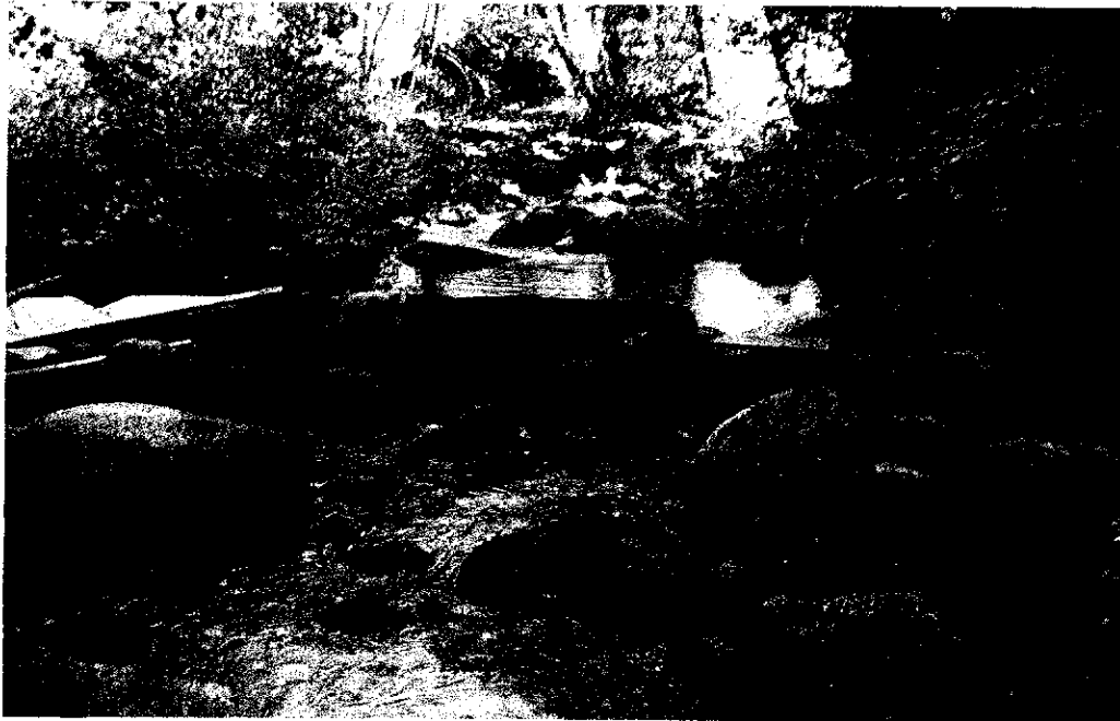
Looking upstream at Darbee Ditch diversion dam