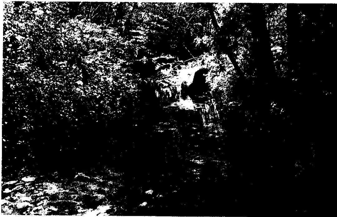
At Gage site below Darbee Ditch