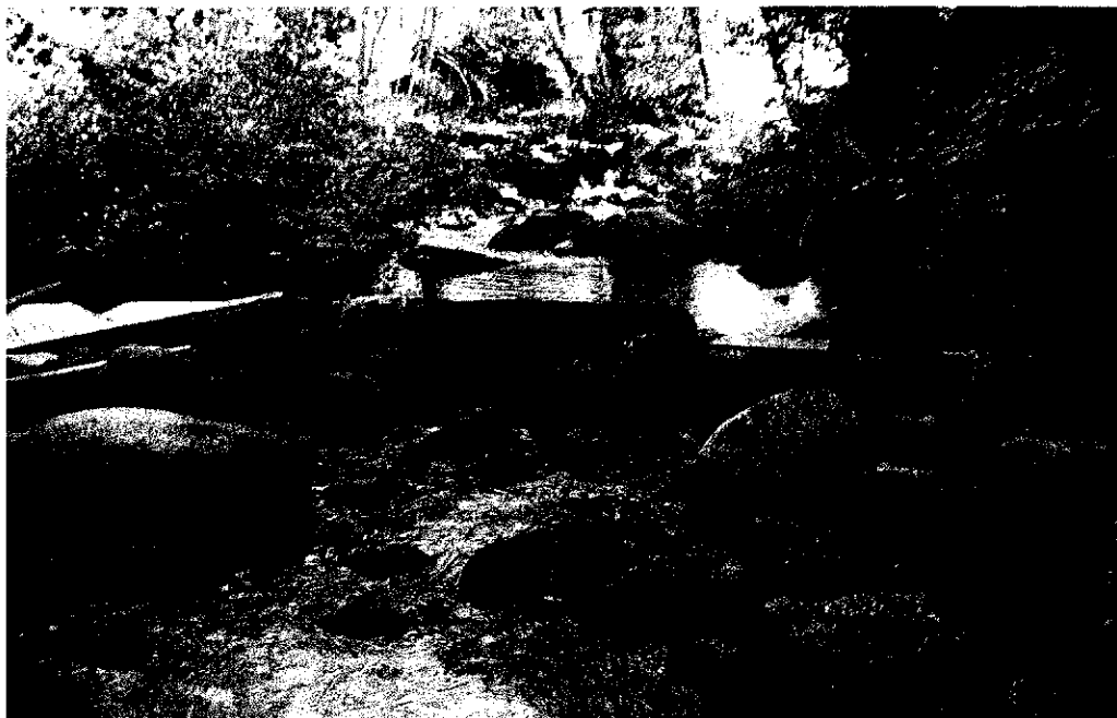
Looking upstream at Darbee Ditch diversion dam