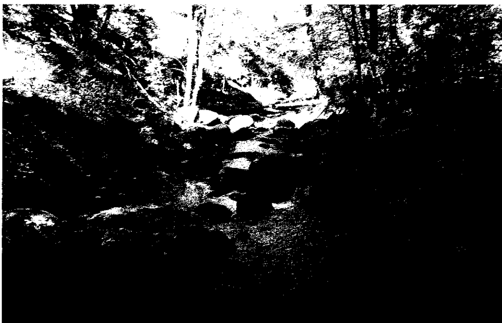
Looking downstream from Darbee Ditch diversion dam