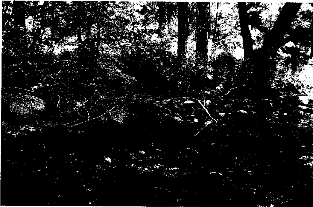
From left bank looking at head of Fay Ditch