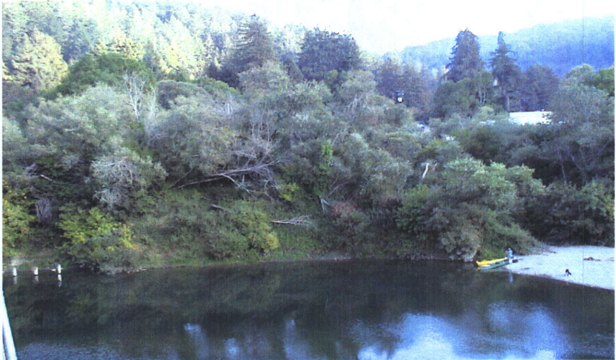
Figure 7 – Plant communities immediately downstream of the point of diversion.