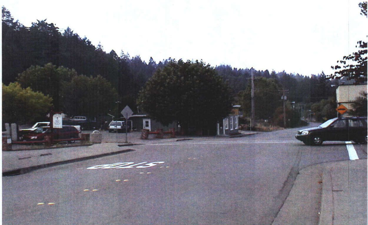
Figure 4 – Plant communities at the place of use.