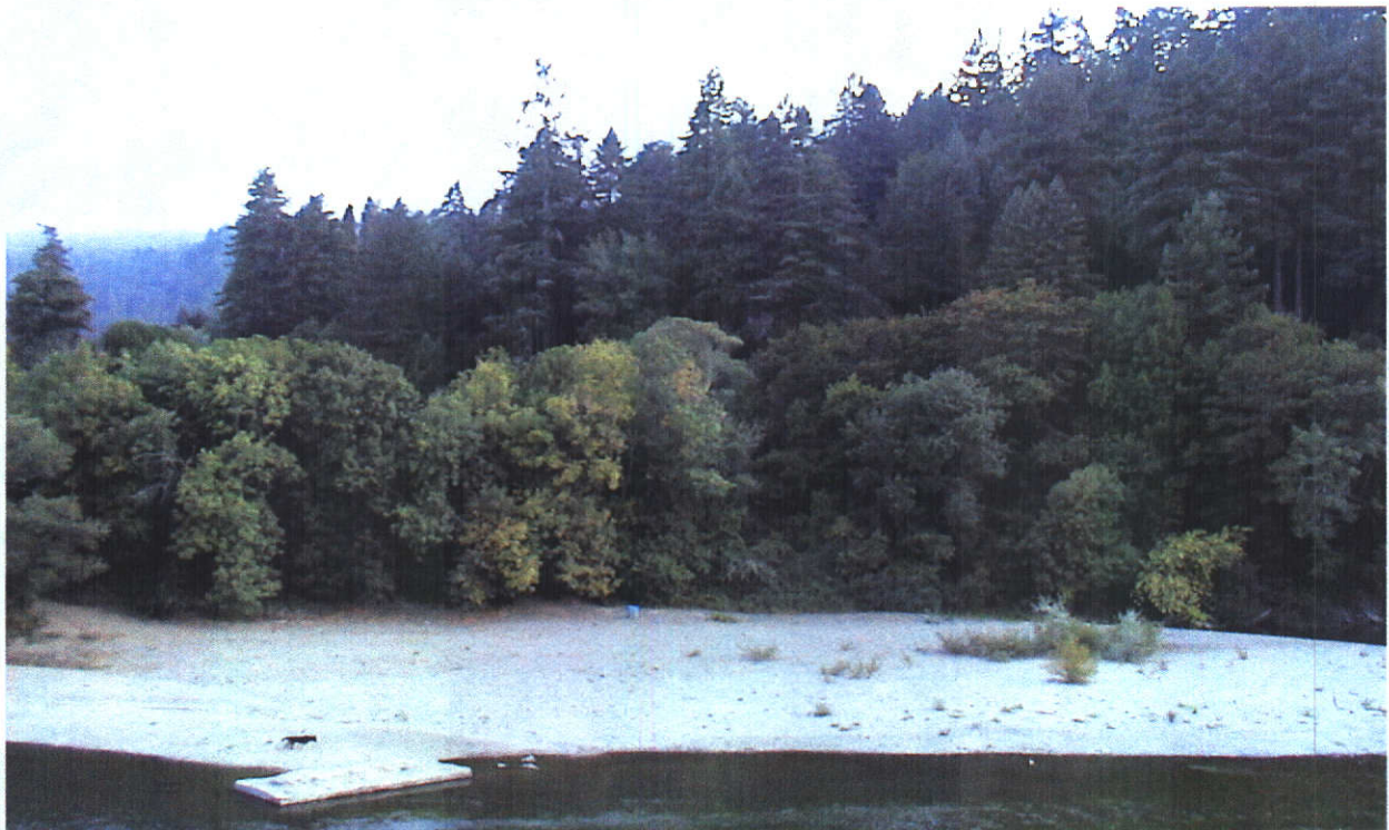
Figure 8 – Plant communities immediately downstream of the point of diversion.