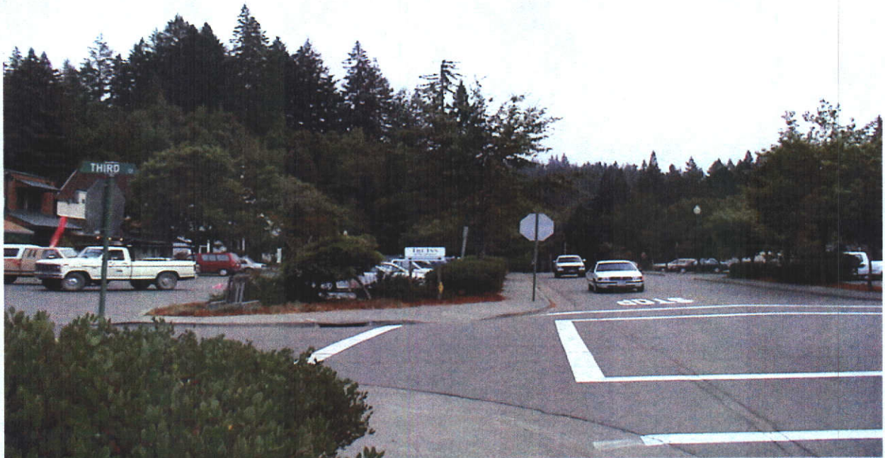
Figure 3 – Plant communities at the place of use.