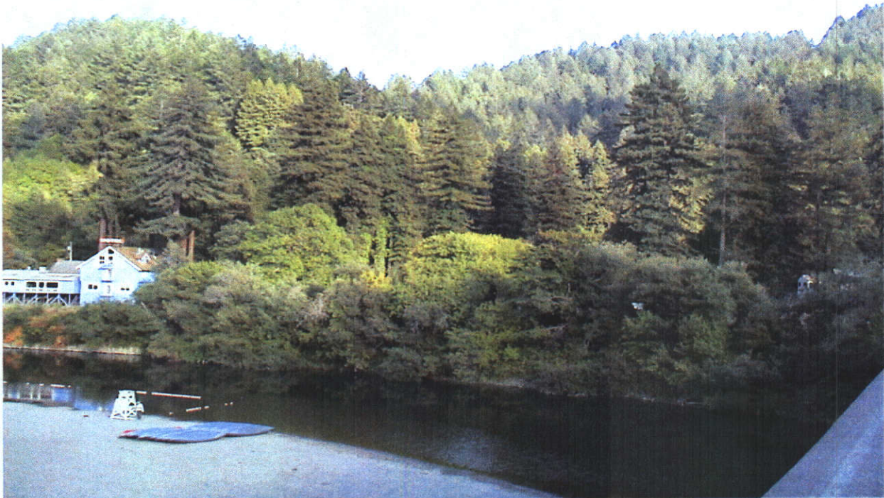
Figure 5 – Plant communities immediately upstream of the point of diversion.