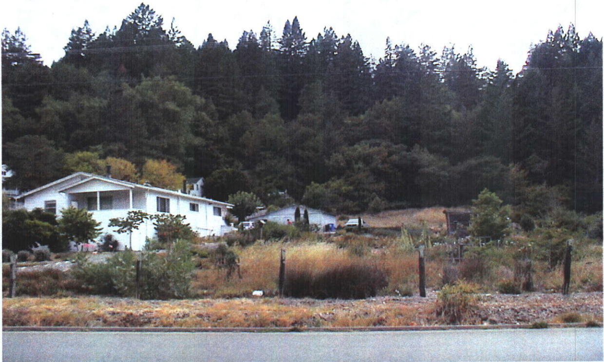
Figure 1 – Plant communities at the place of use.