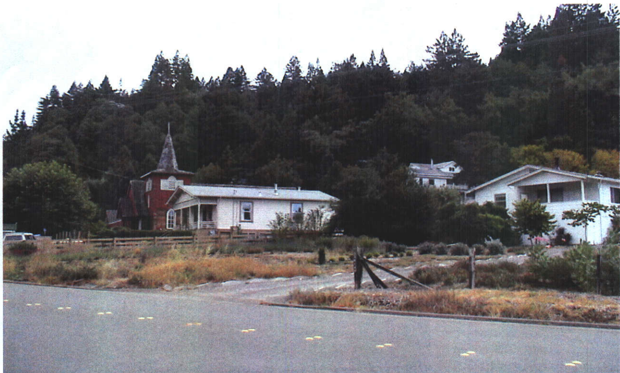
Figure 2 – Plant communities at the place of use.