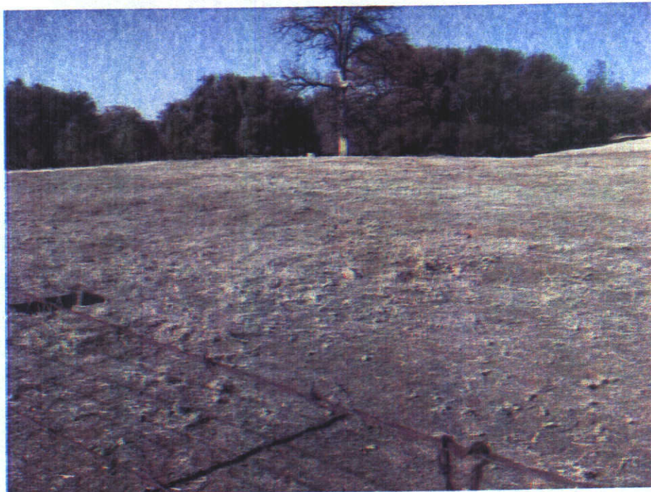
Existing Place of Use