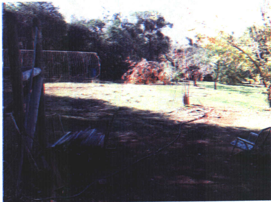
Proposed Place of Use (currently irrigated from groundwater well)