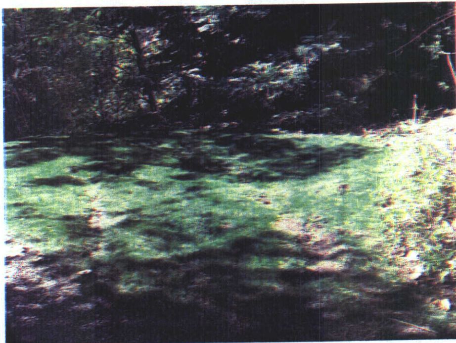
Proposed Place of Use (currently irrigated from groundwater well)