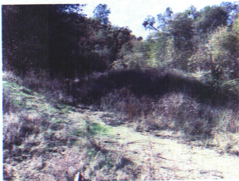
Proposed Place of Use