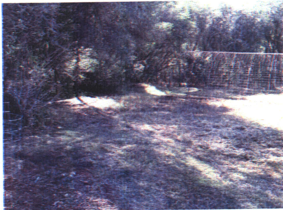
Proposed Place of Use (currently irrigated from groundwater well)