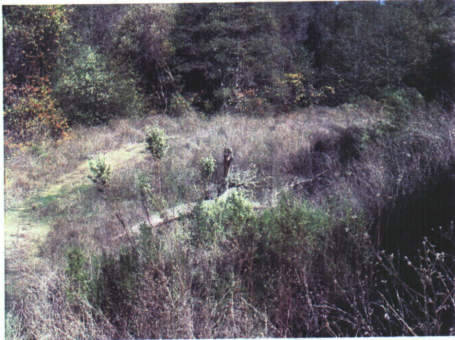
Proposed Place of Use