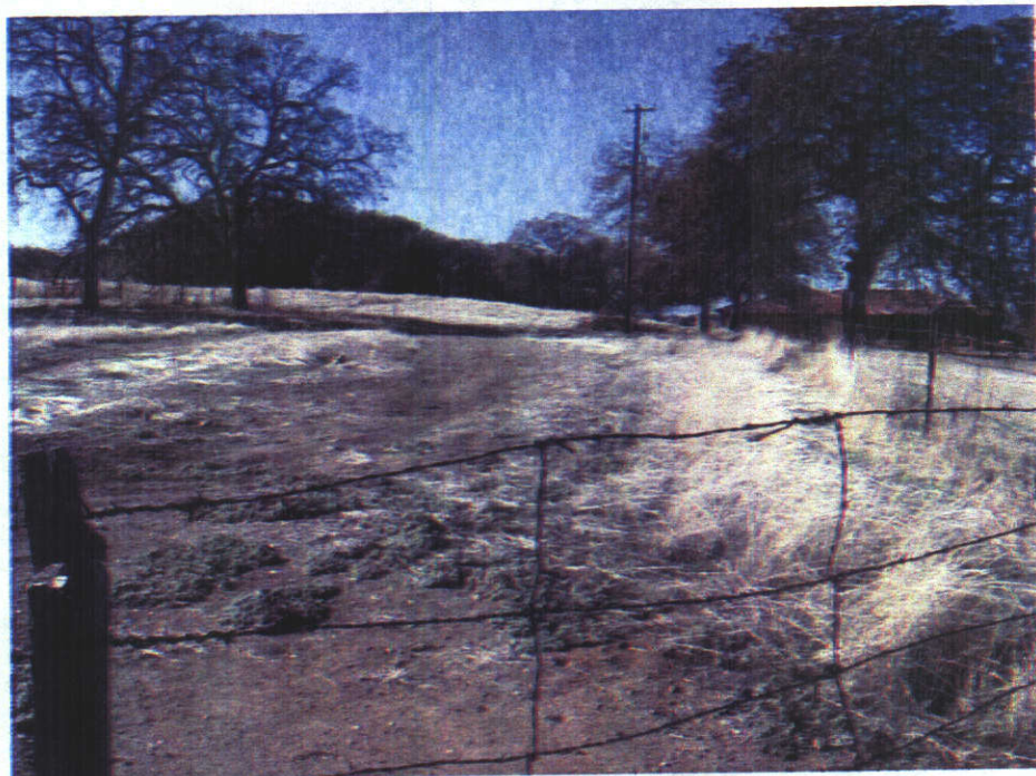
Existing Place of Use