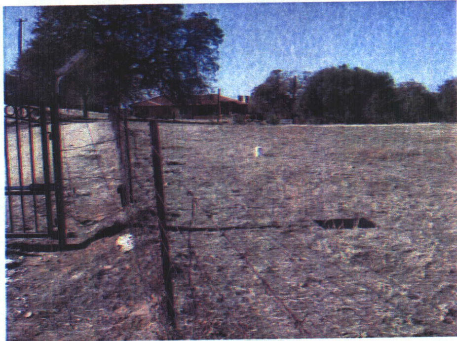
Existing Place of Use