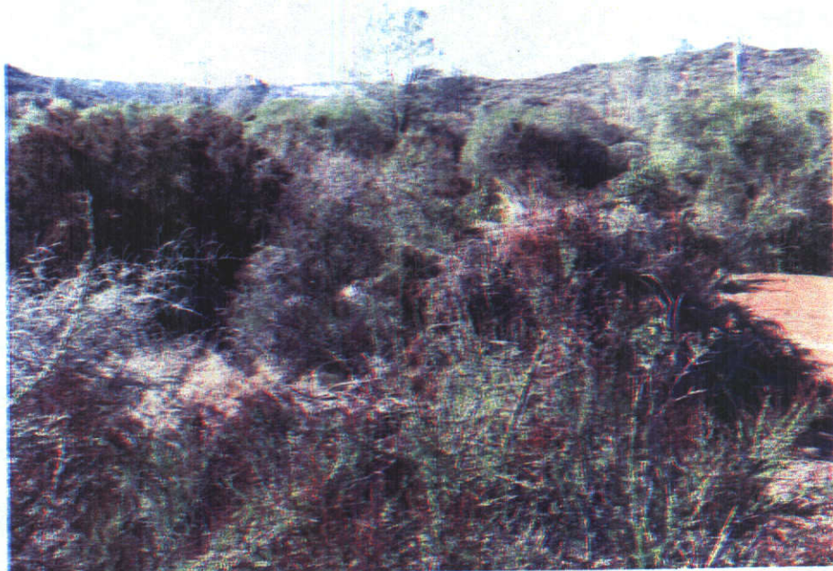
Proposed Place of Use