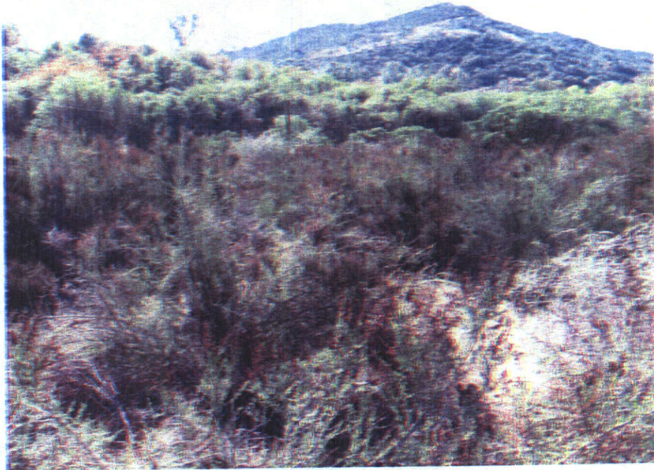
Proposed Place of Use