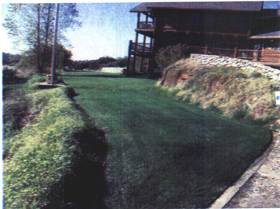
Proposed Place of Use (currently irrigated from groundwater well)