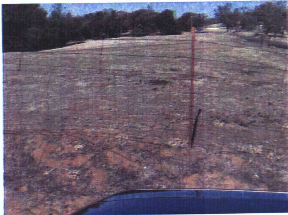
Existing Place of Use