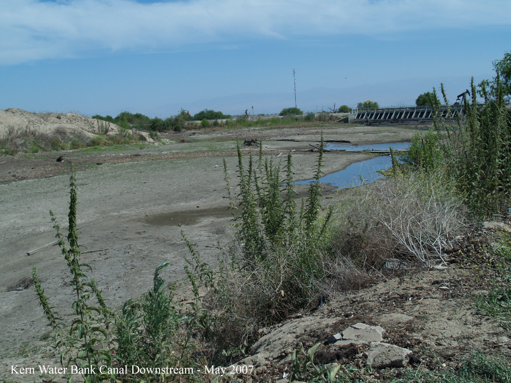
Kern Water Bank Canal Downstream - May 2007