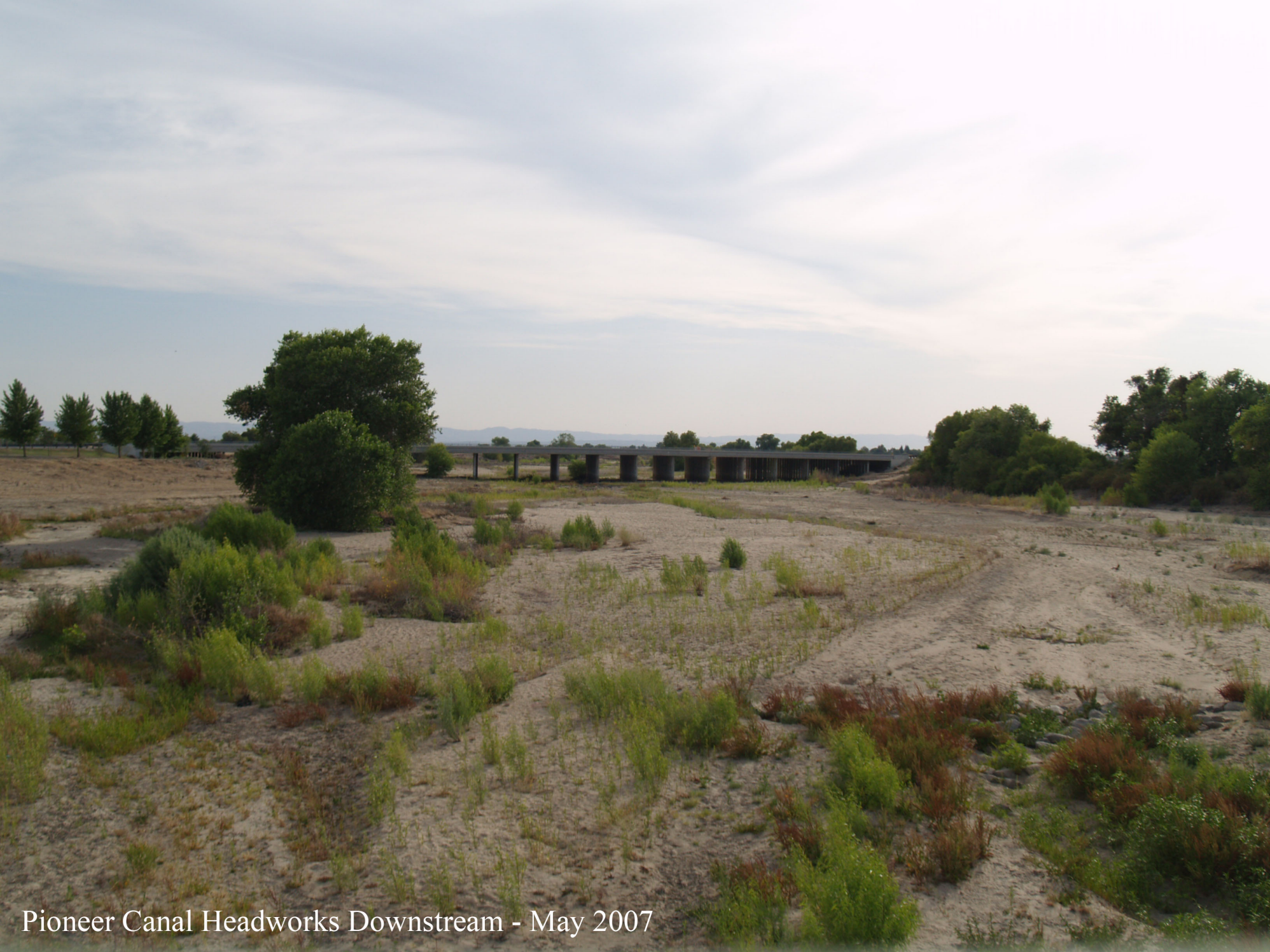
Pioneer Canal Headworks Downstream - May 2007