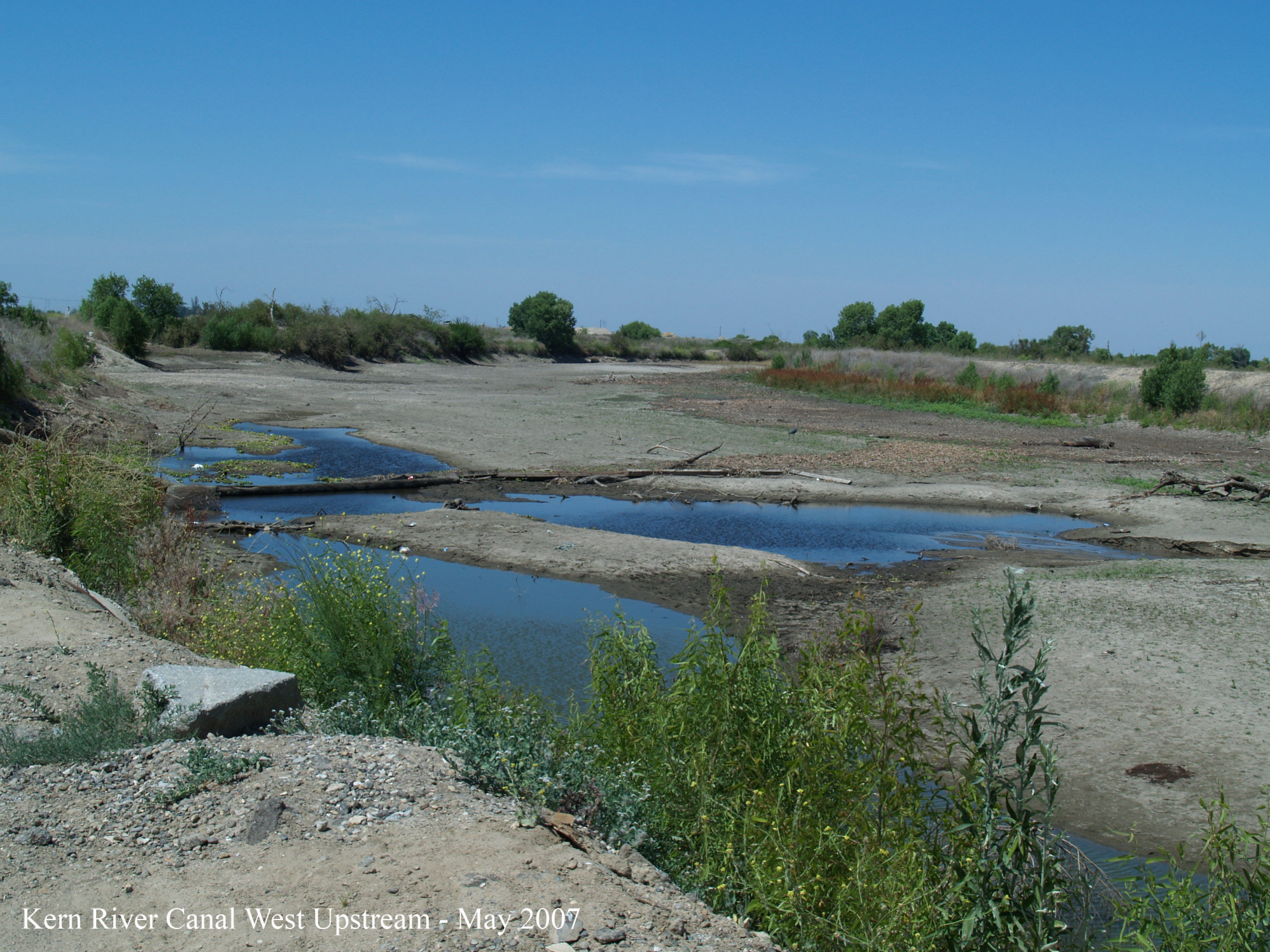
Kern River Canal West Upstream - May 2007