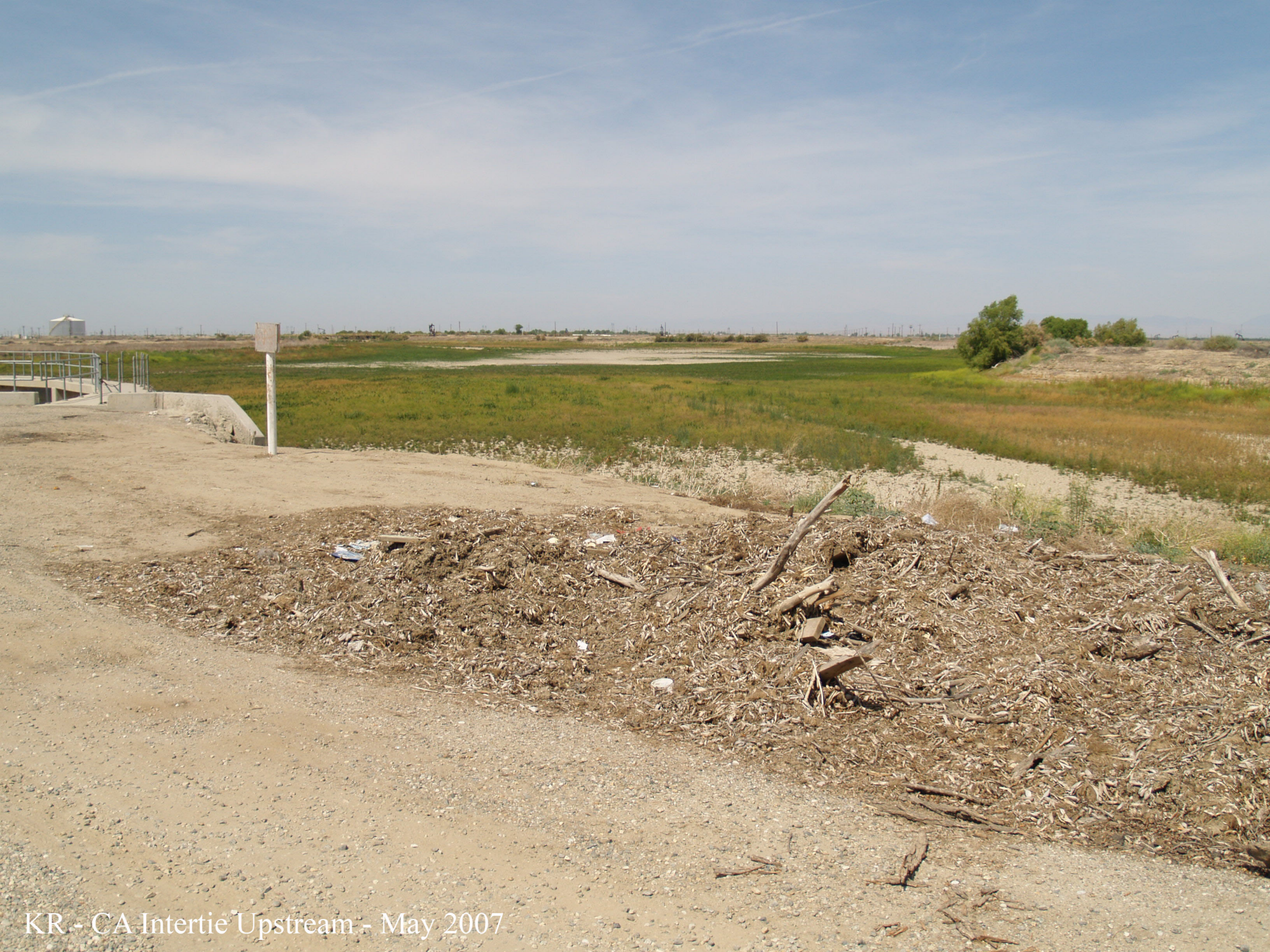
KR - CA Intertie Upstream - May 2007