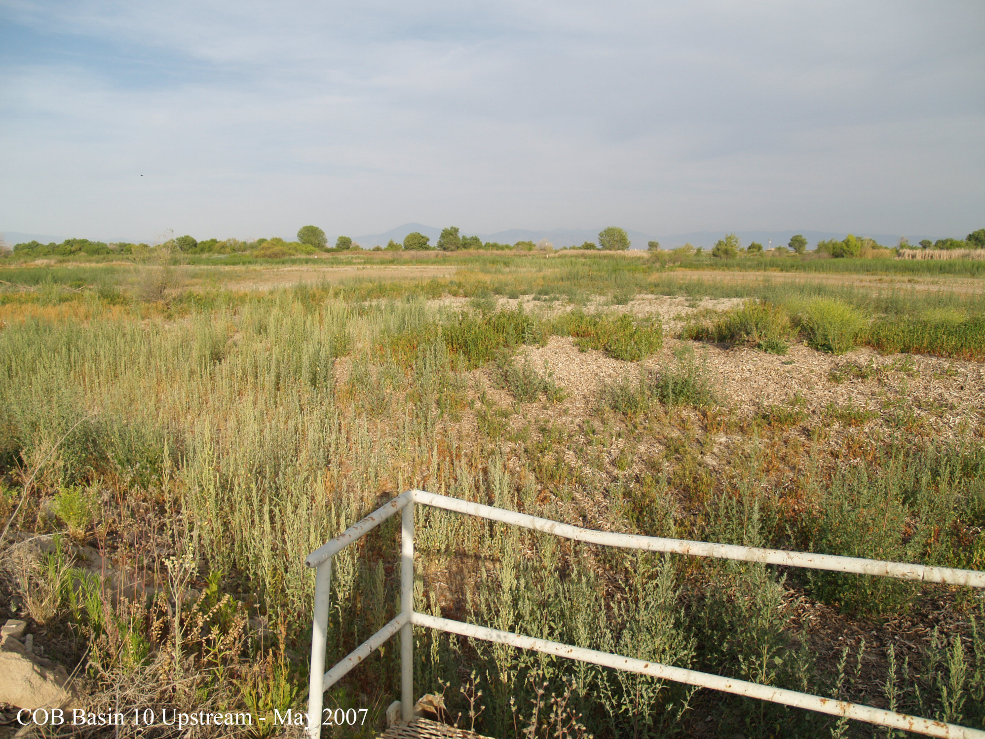
COB Basin 10 Upstream - May 2007