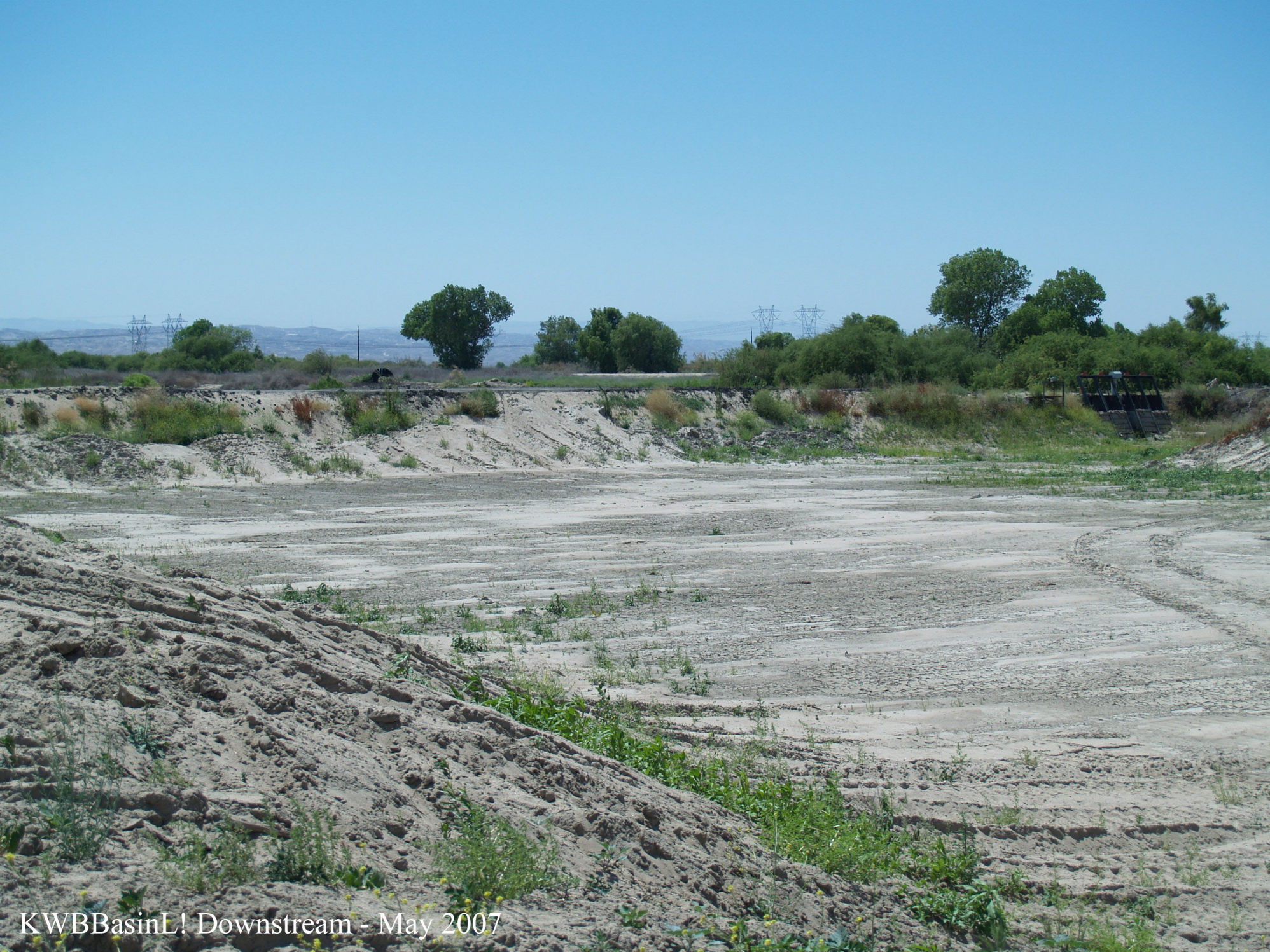
KWBBasinL! Downstream - May 2007