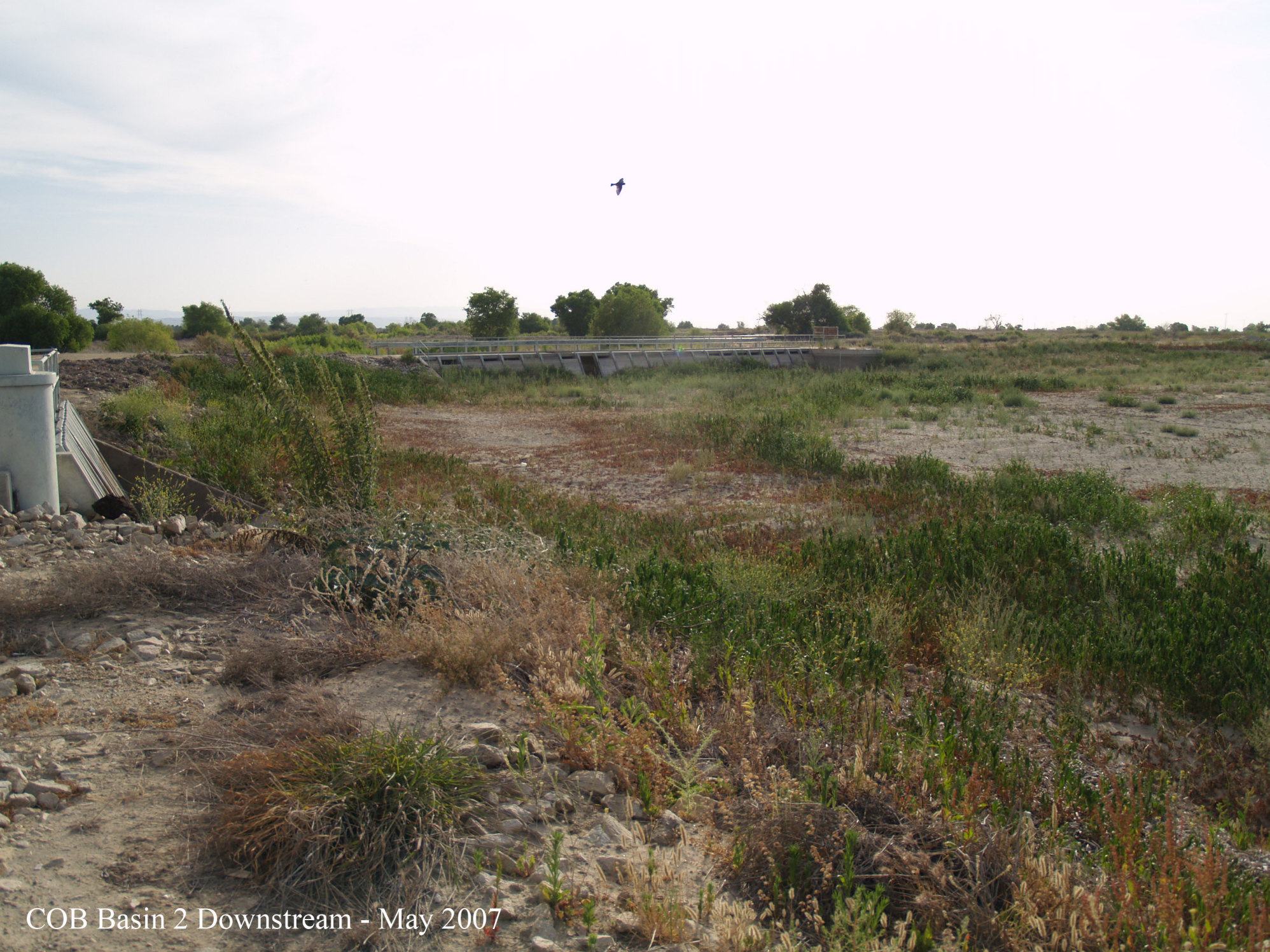
COB Basin 2 Downstream - May 2007