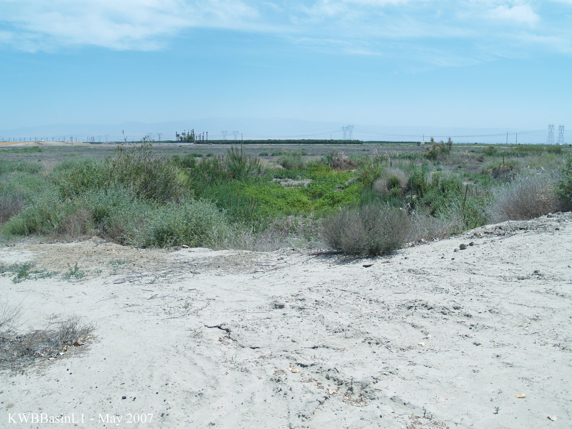
KWBBasinL1 - May 2007