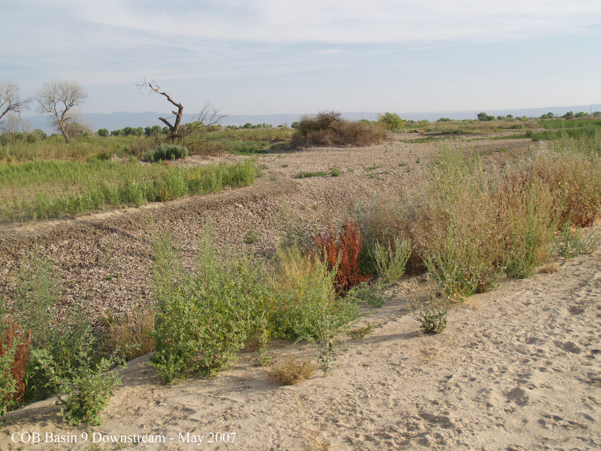
COB Basin 9 Downstream - May 2007