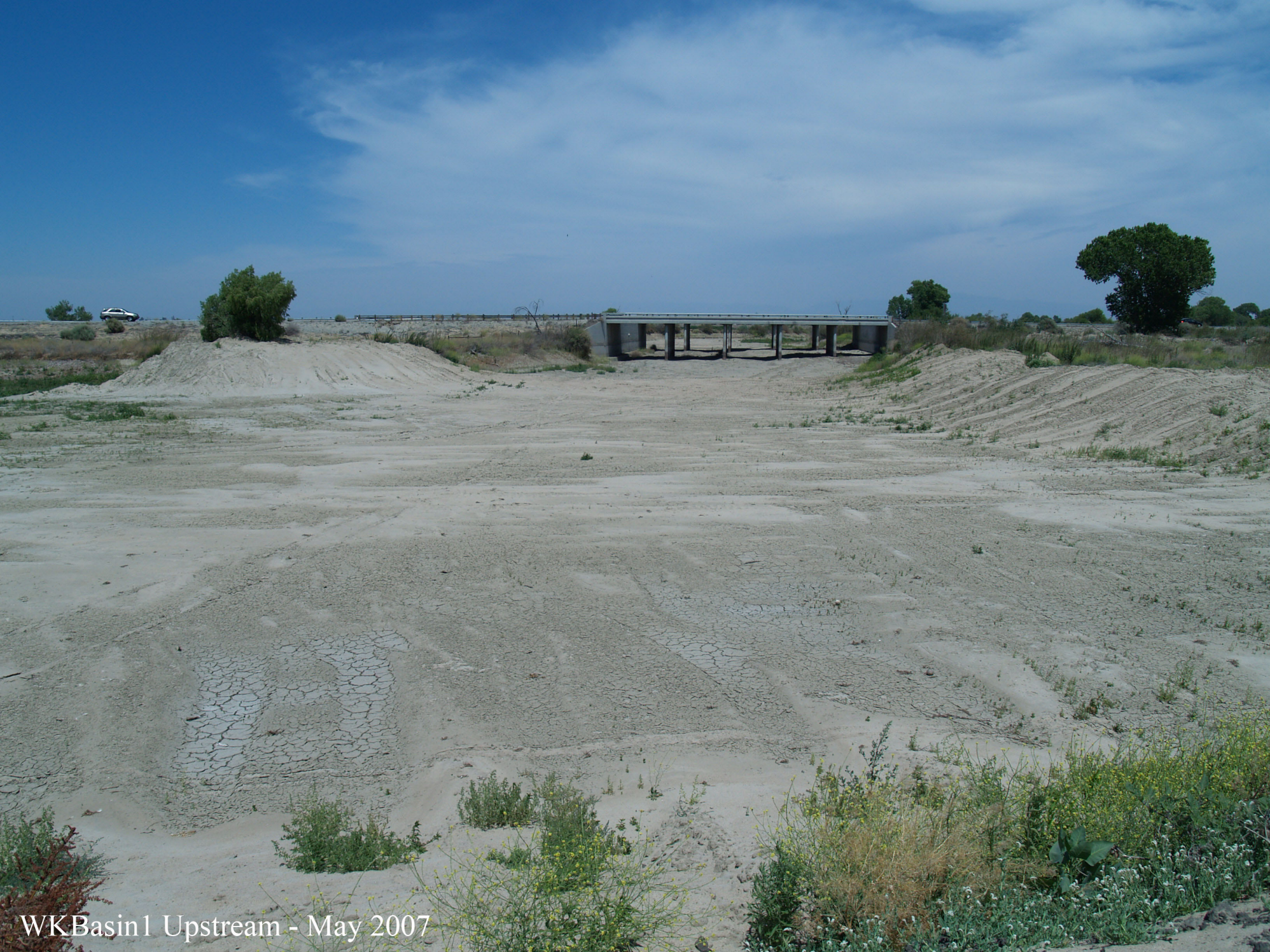
WKBasin1 Upstream - May 2007