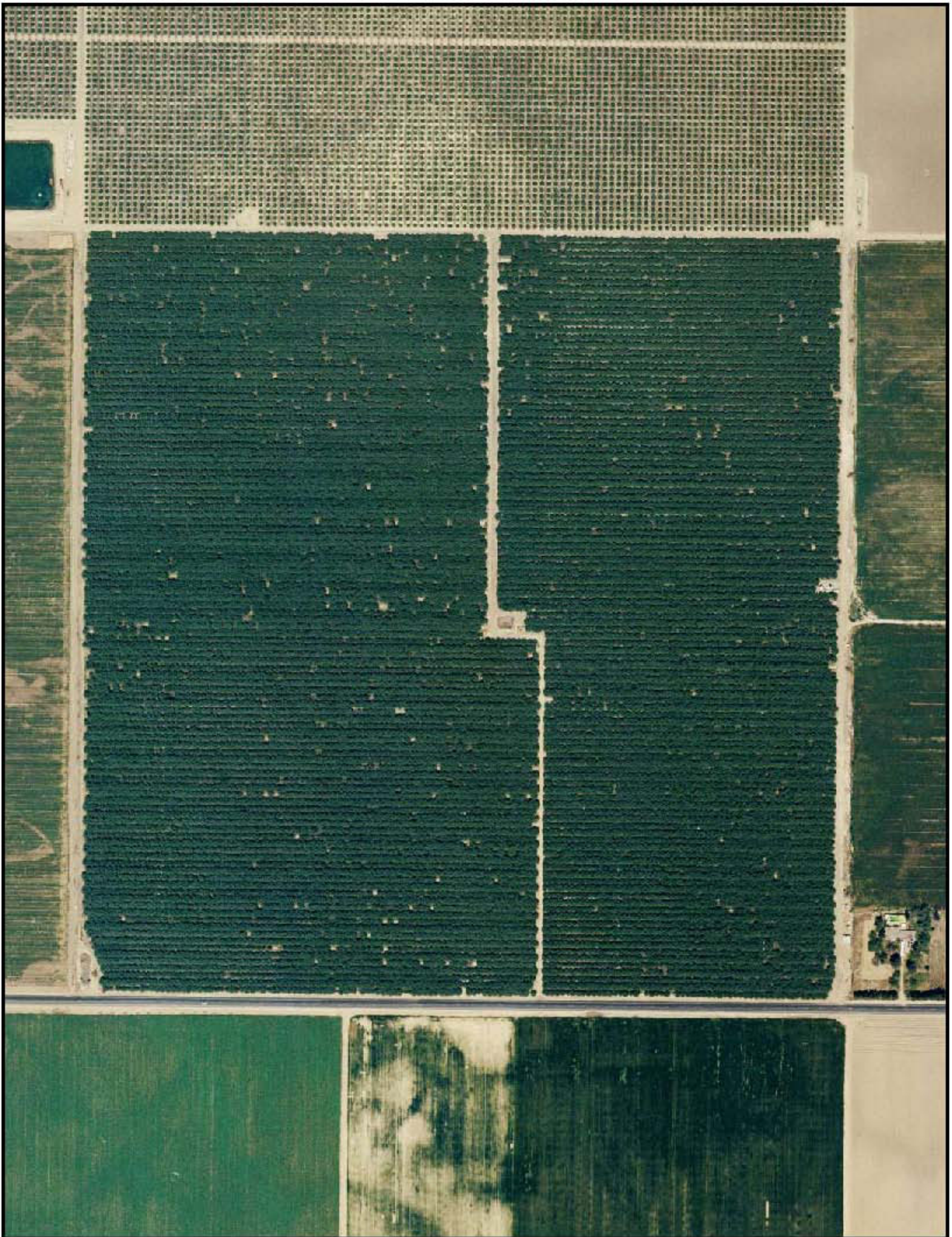
Aerial - Typical Ag Place of Use - May 2007