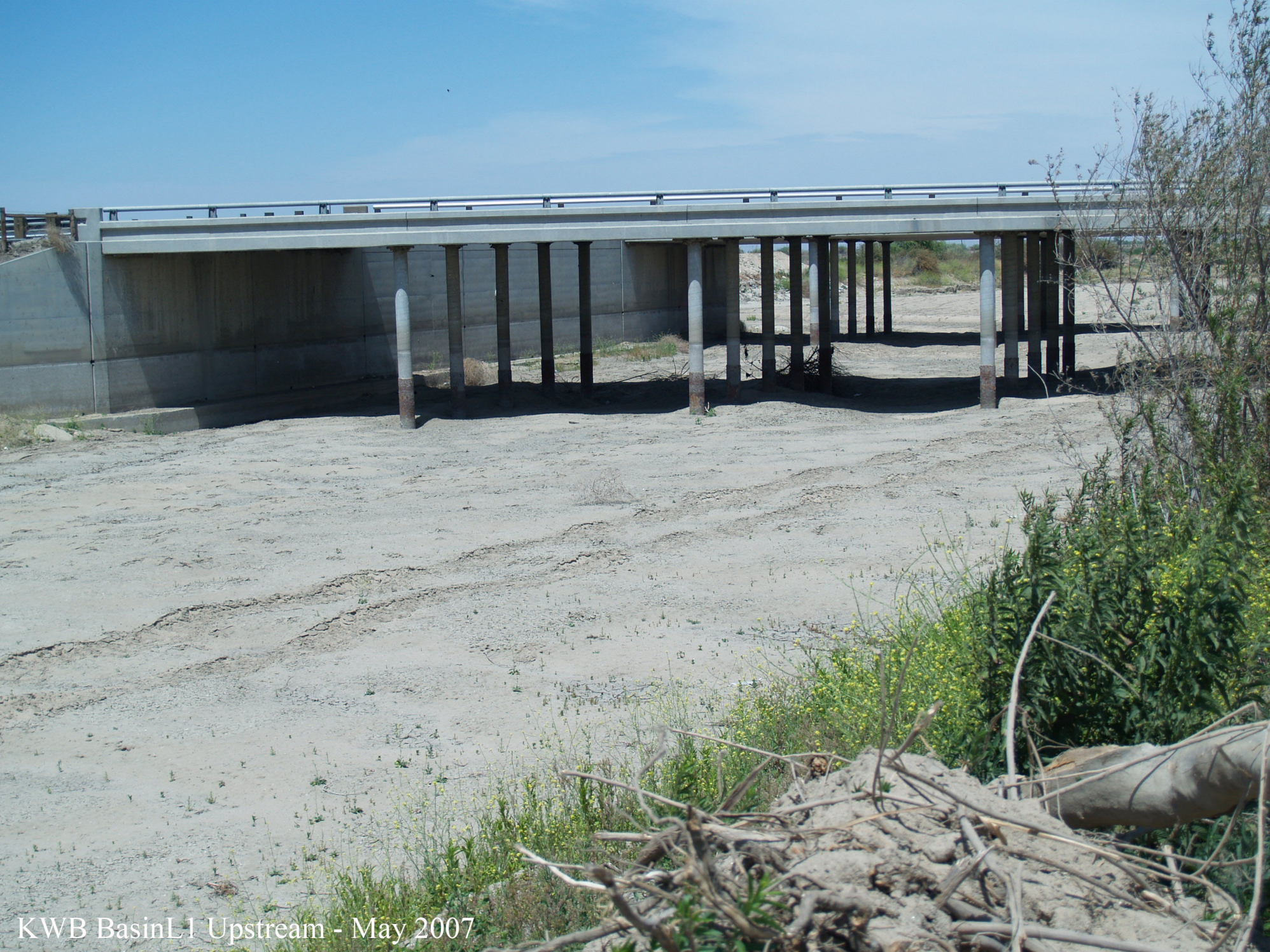
KWB BasinL1 Upstream - May 2007