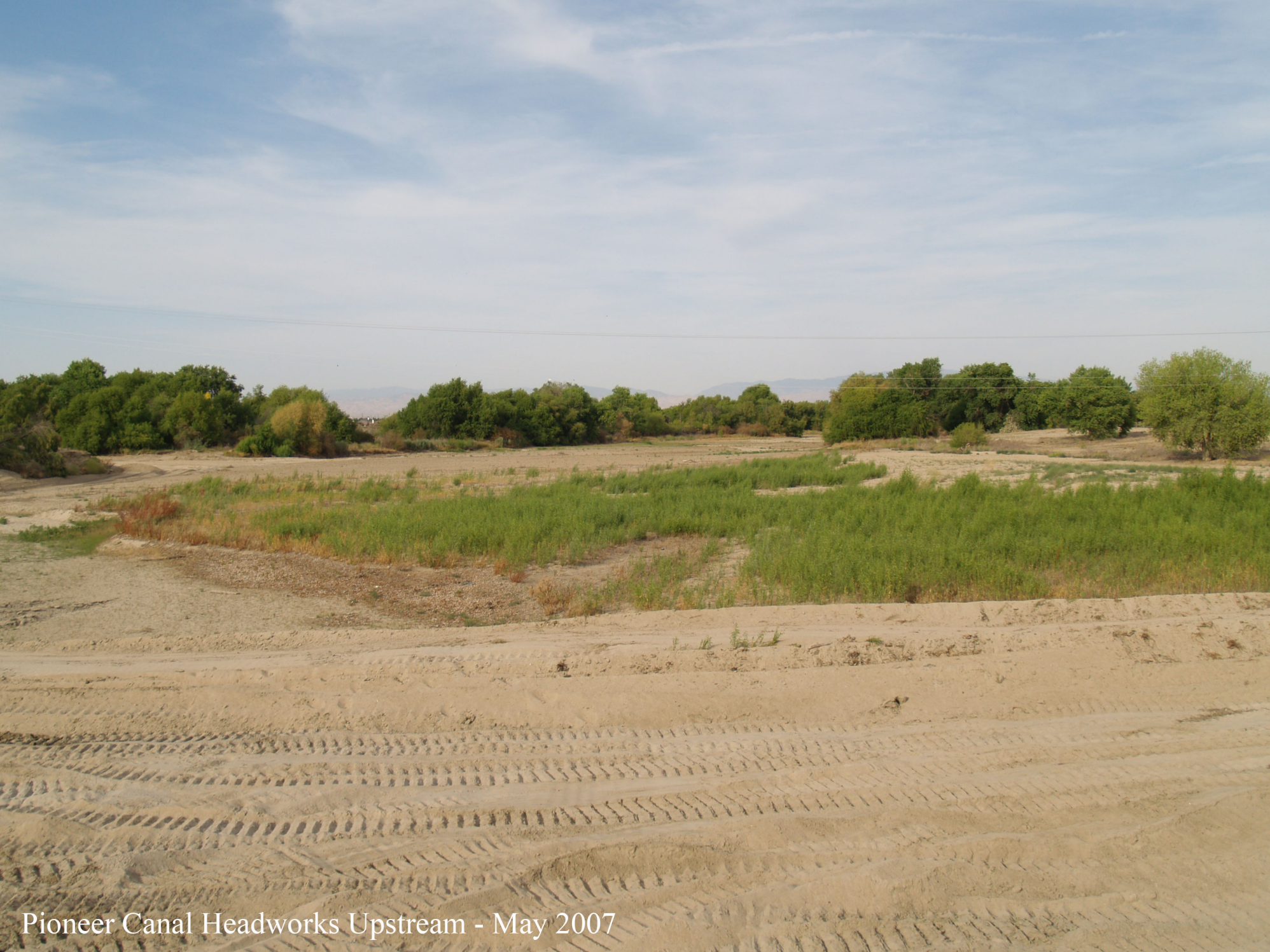
Pioneer Canal Headworks Upstream - May 2007