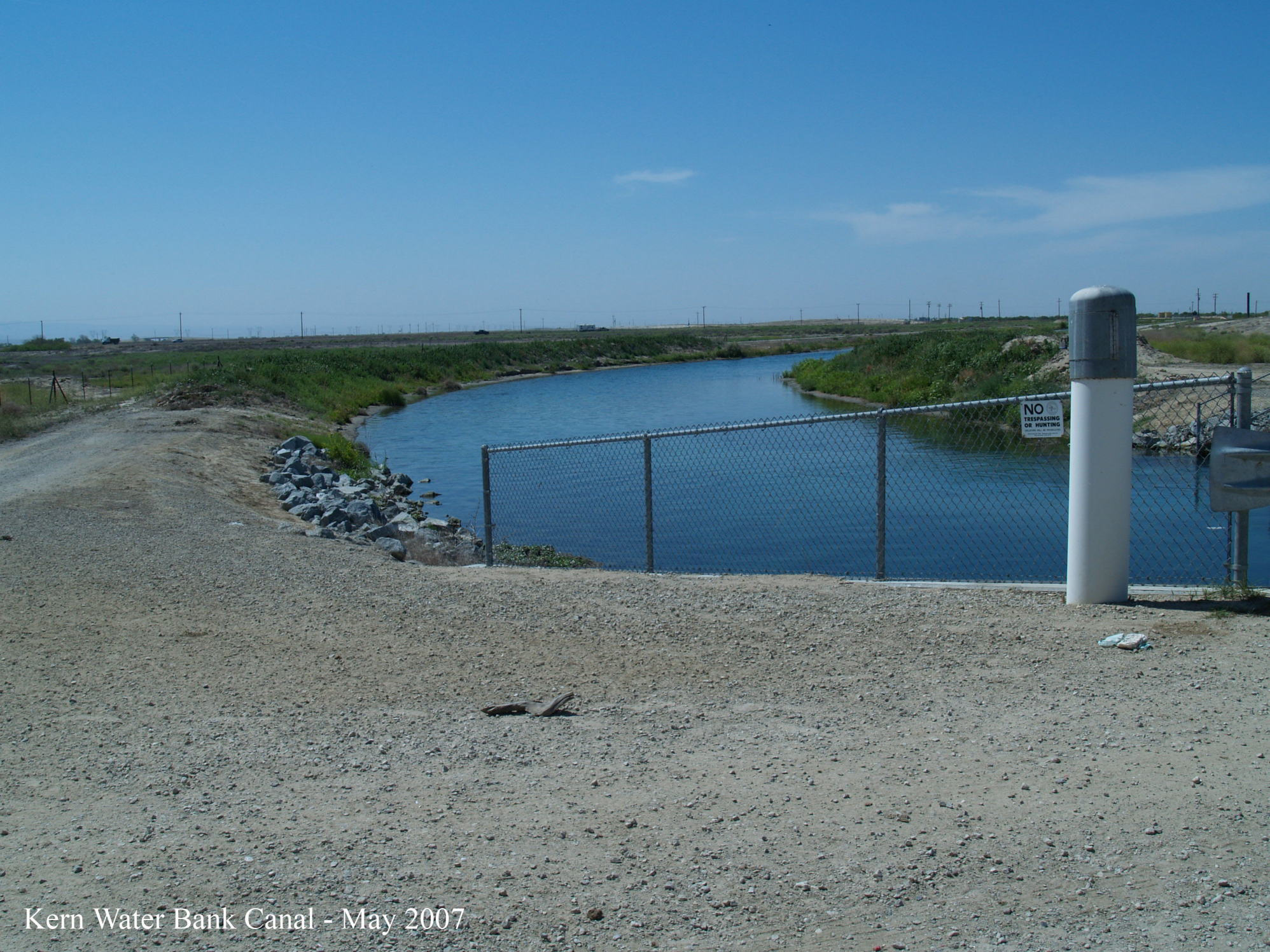
Kern Water Bank Canal - May 2007