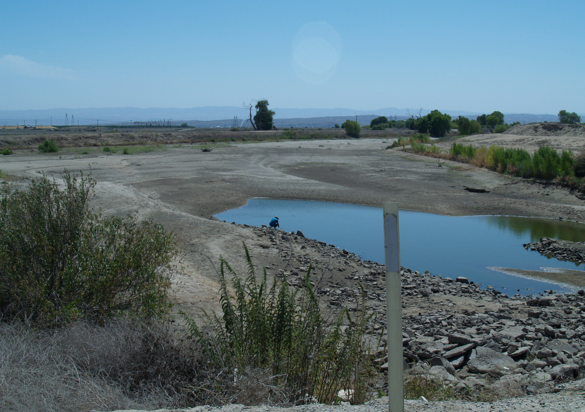
Kern River Canal West Downstream - May 2007