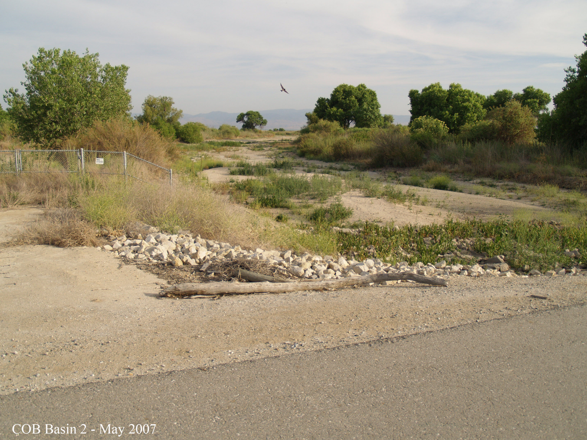
COB Basin 2 - May 2007