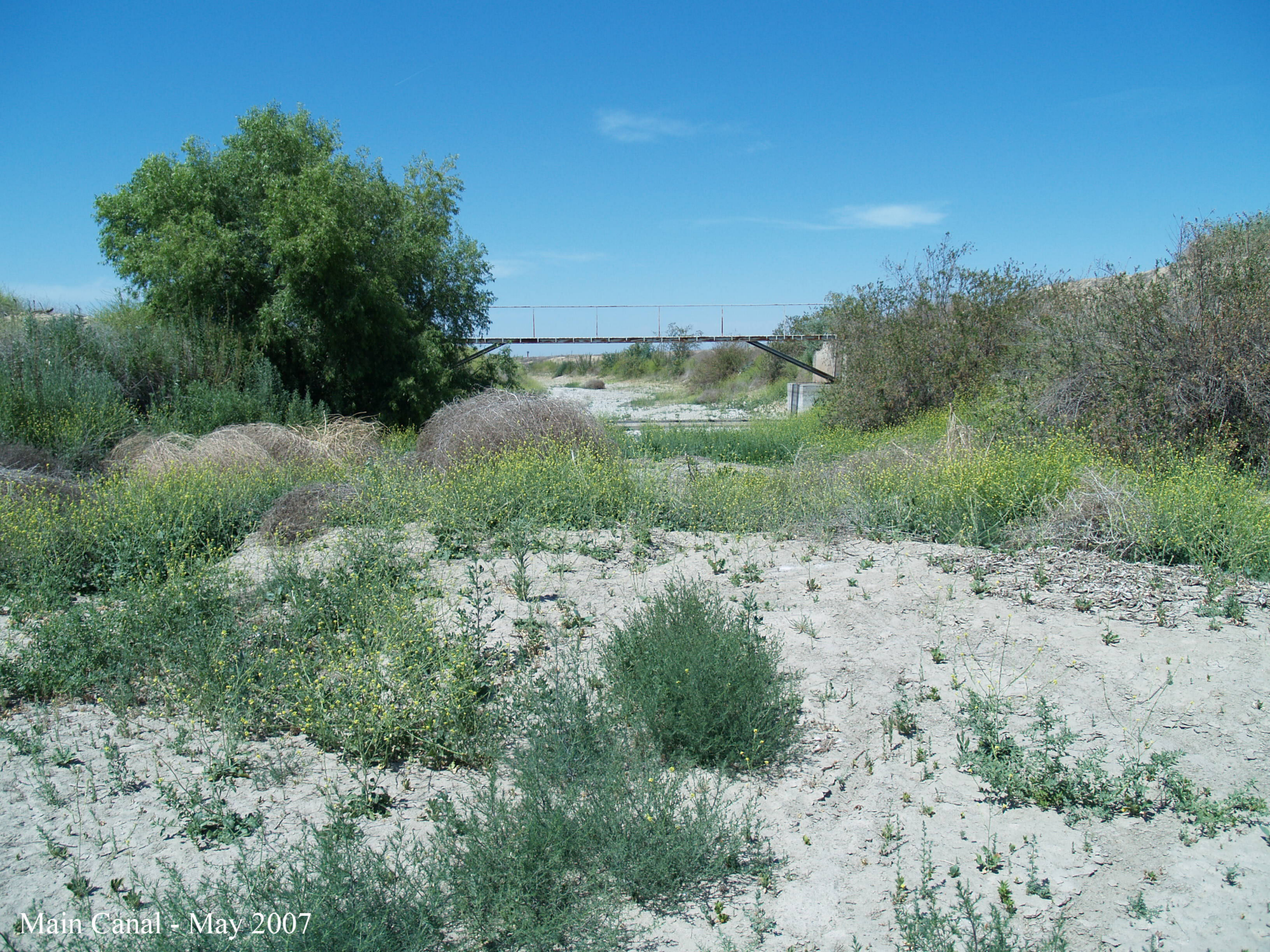
Main Canal - May 2007