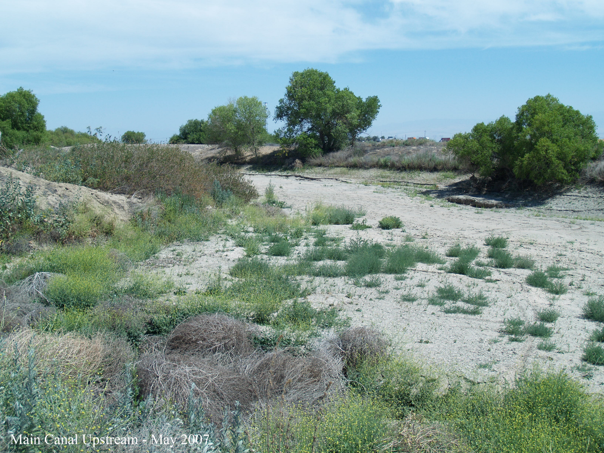
Main Canal Upstream - May 2007