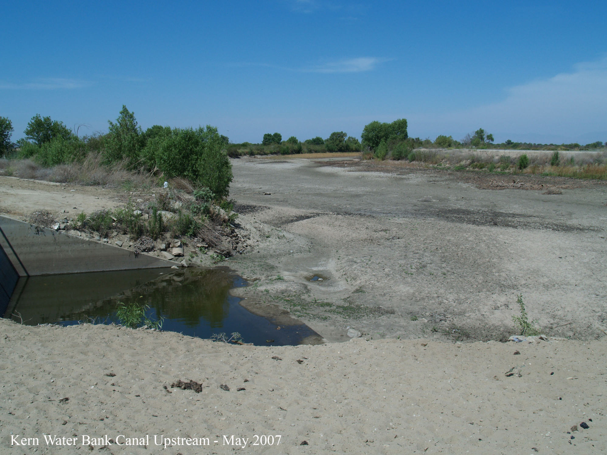
Kern Water Bank Canal Upstream - May 2007