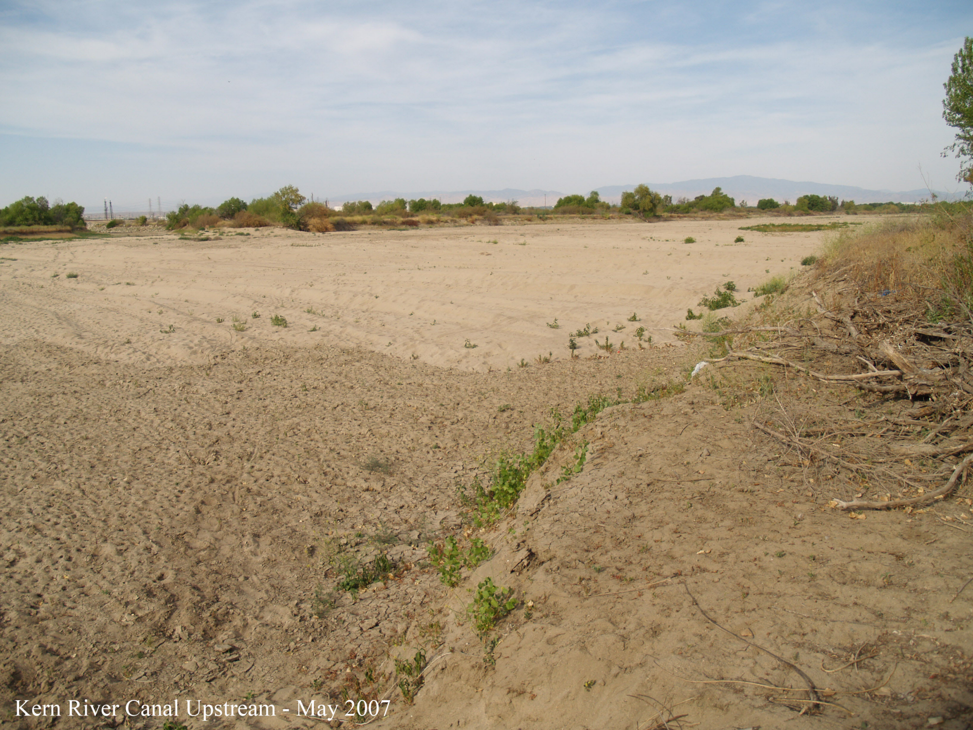
Kern River Canal Upstream - May 2007