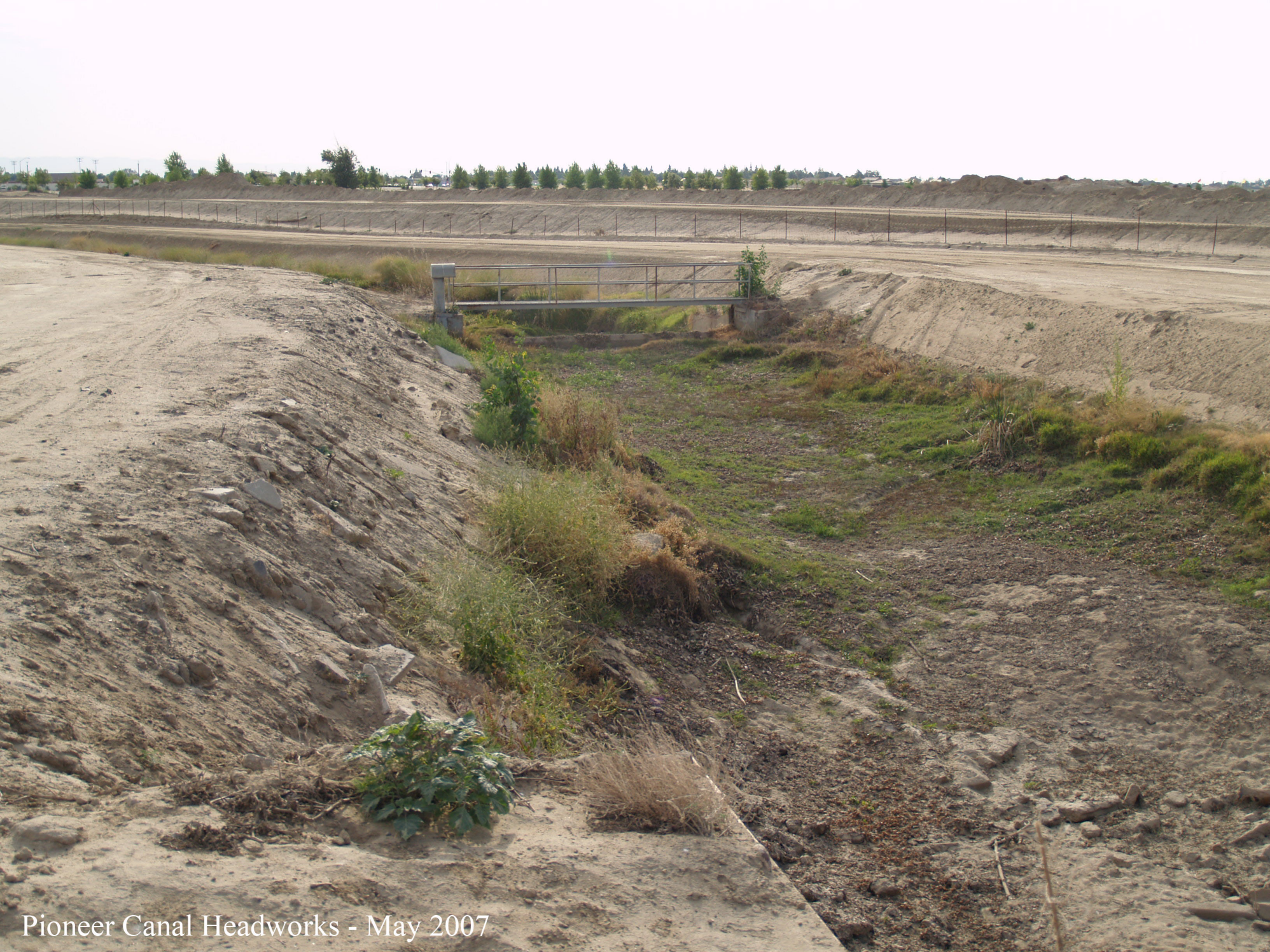
Pioneer Canal Headworks - May 2007