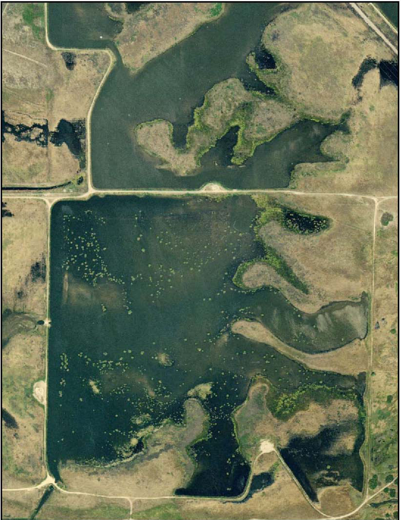
Aerial - Kern Water Bank - May 2007