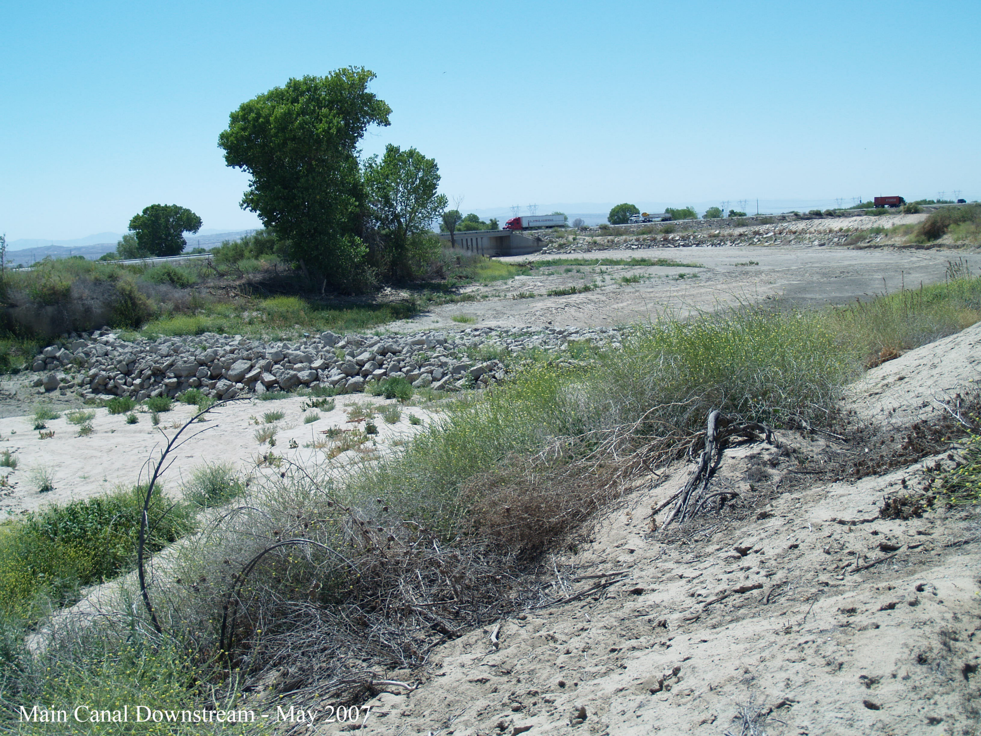
Main Canal Downstream - May 2007