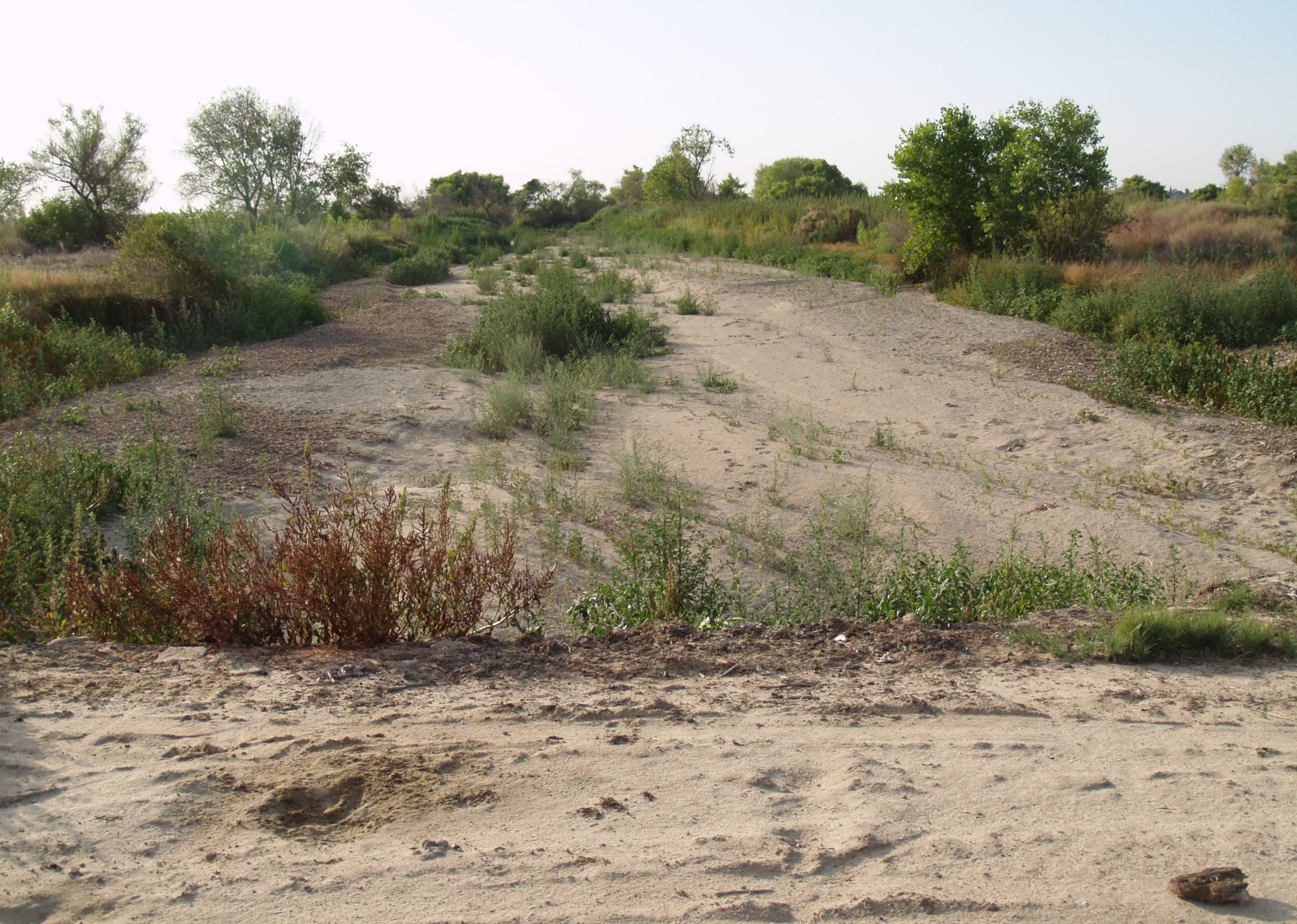
COB Basin 9 - May 2007