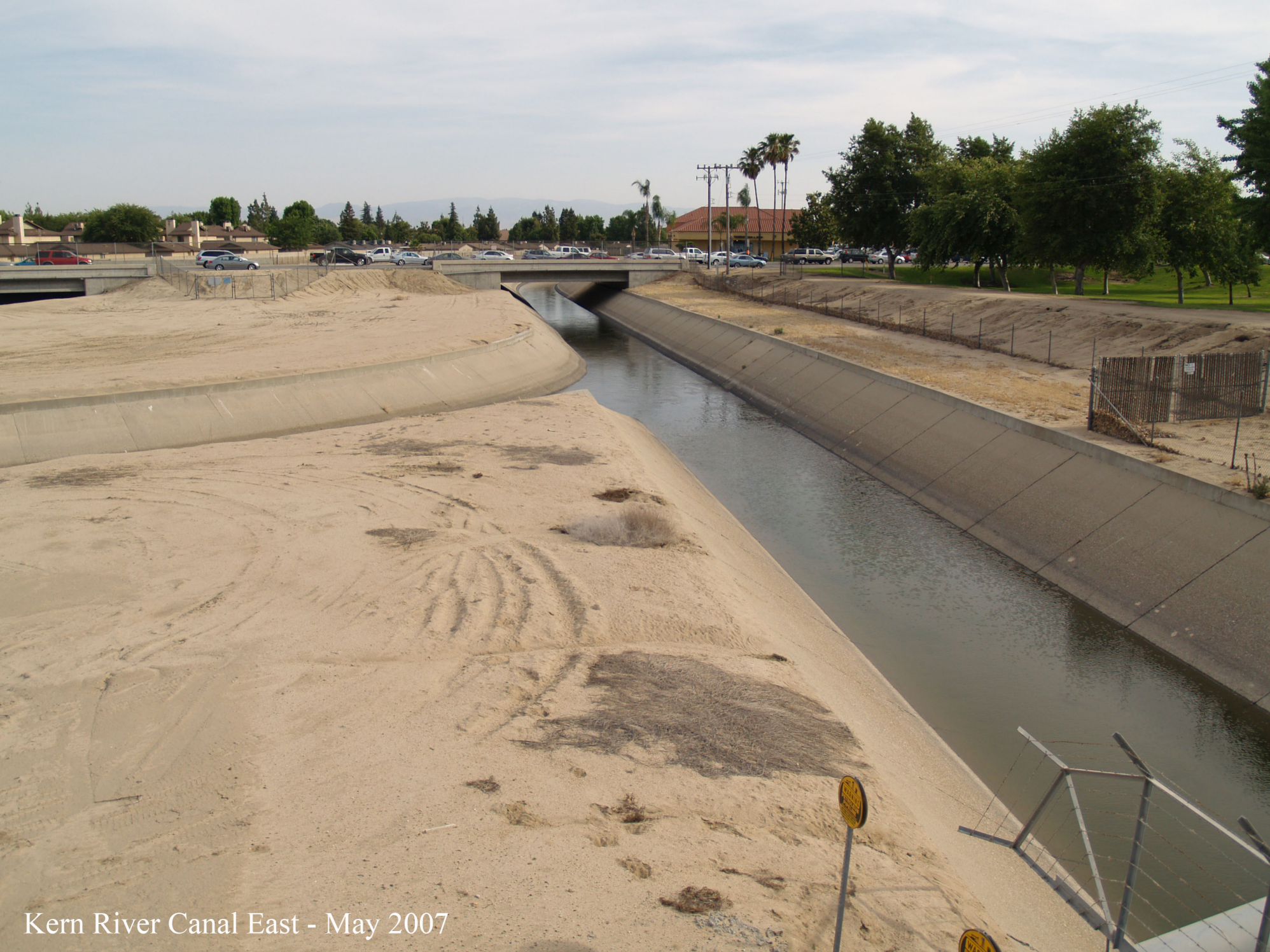
Kern River Canal East - May 2007