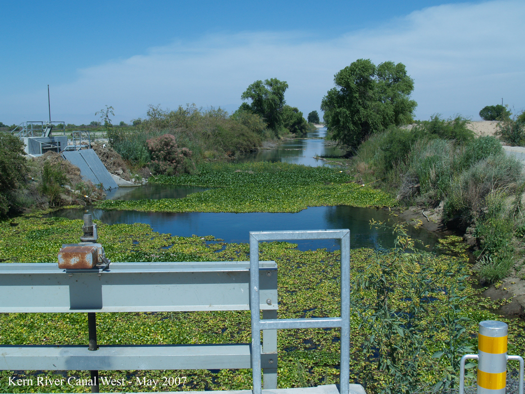
Kern River Canal West - May 2007