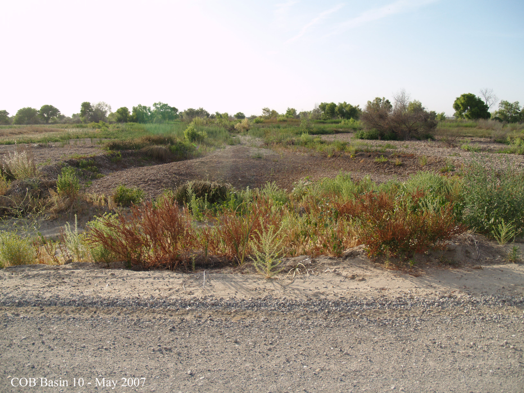
COB Basin 10 - May 2007