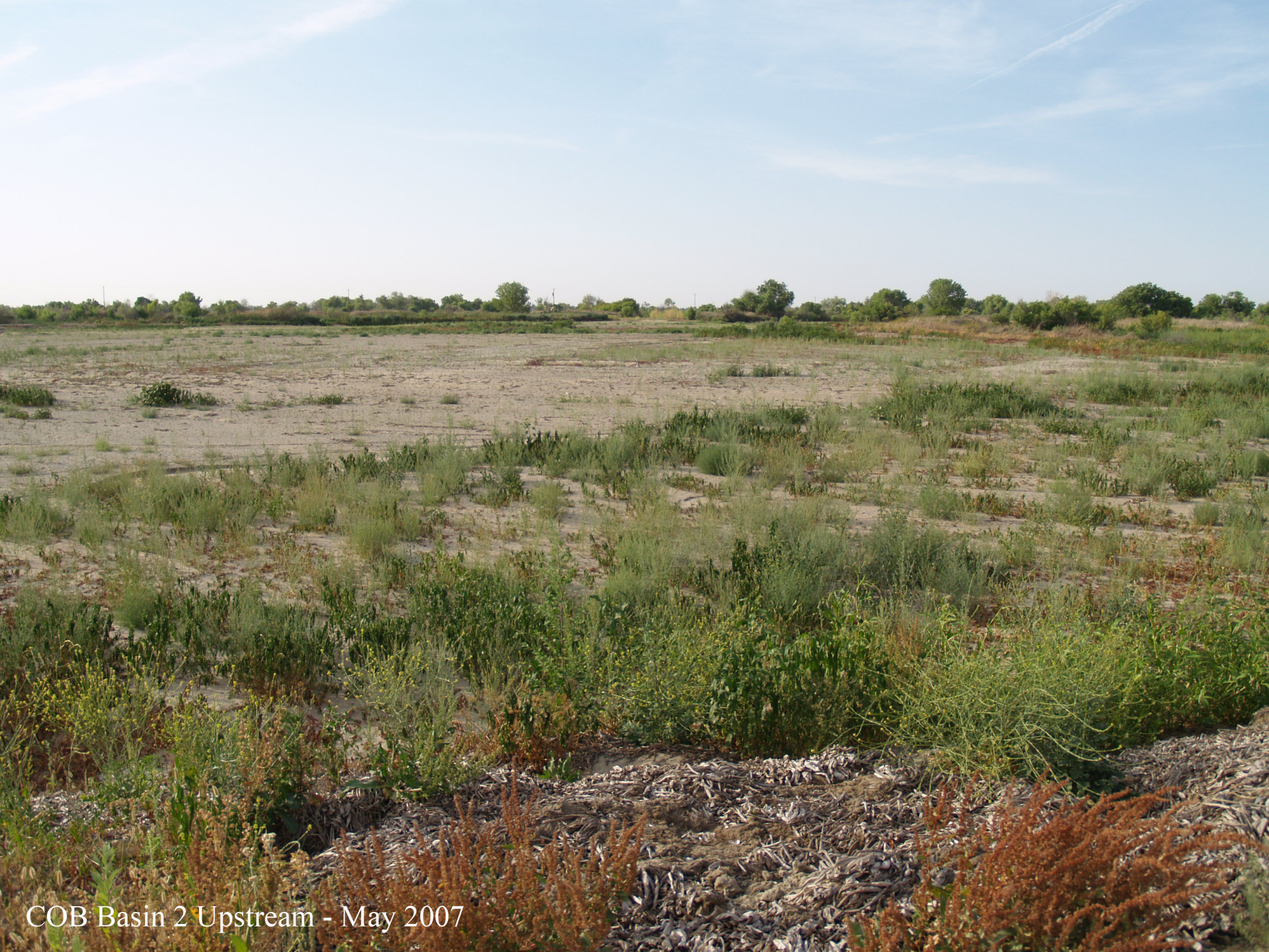
COB Basin 2 Upstream - May 2007