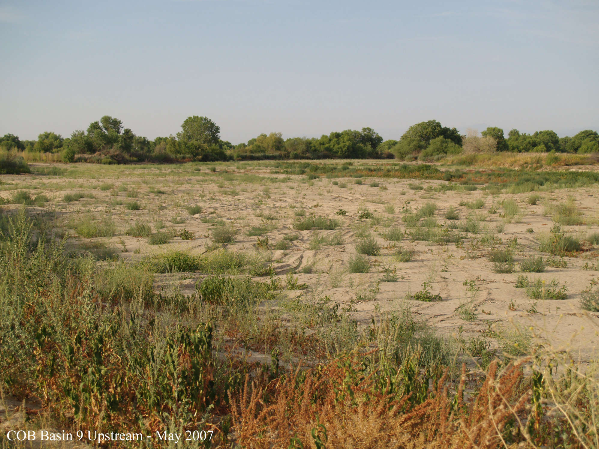
COB Basin 9 Upstream - May 2007