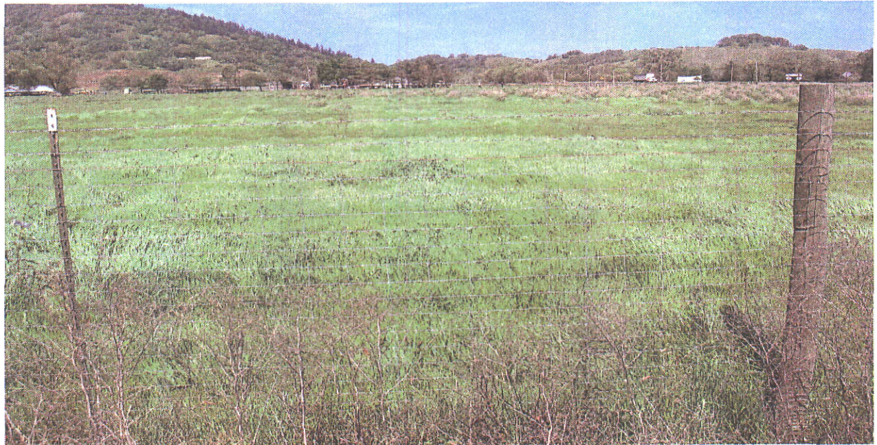
Site of proposed offstream Reservoir "C"