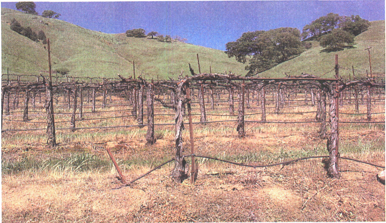
Existing place of use (typical)