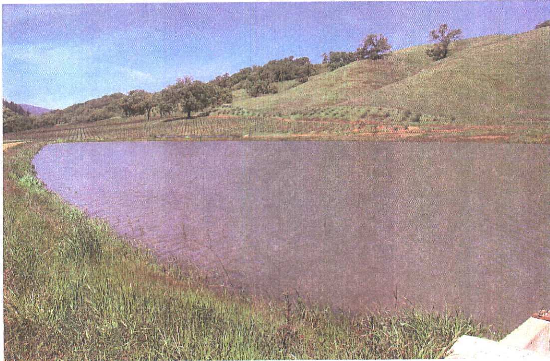
Existing offstream Reservoir "A" and existing place of use