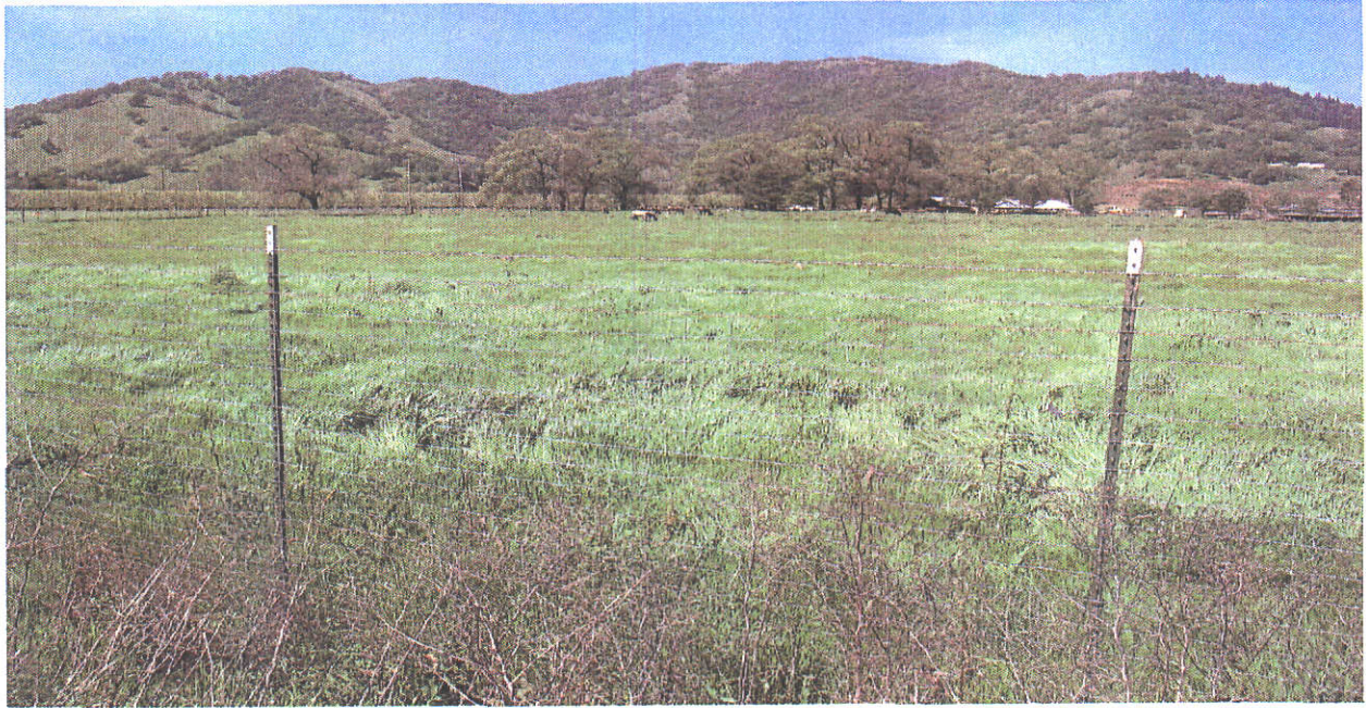
Site of proposed offstream Reservoir "C"