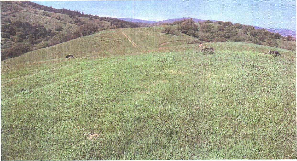
Proposed place of use (typical)