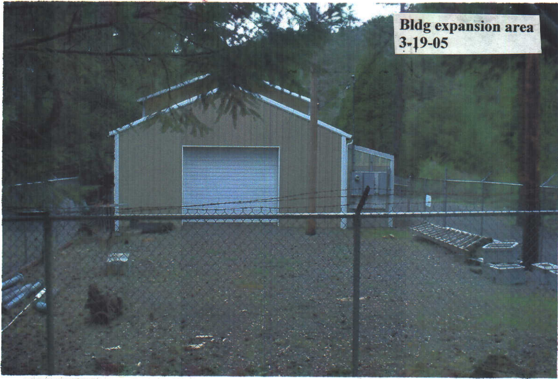
Bldg expansion area 3-19-05